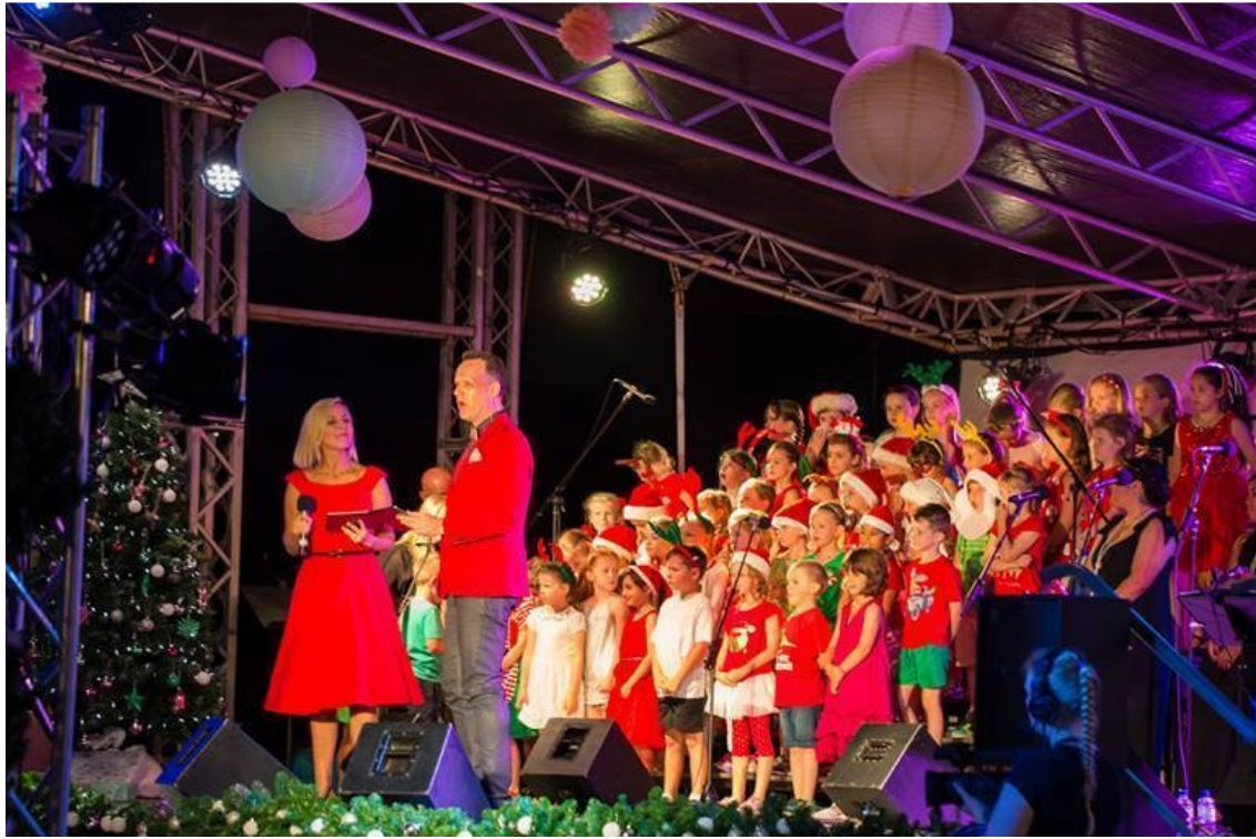
Wakerley Carols 2015.