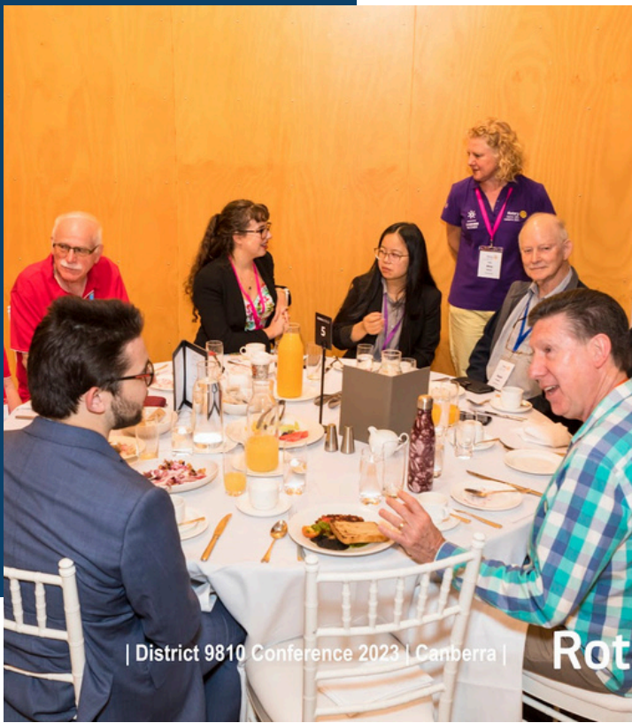
| District 9810 Conference 2023 | Canberra |