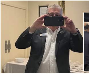
Cameras at 10 paces