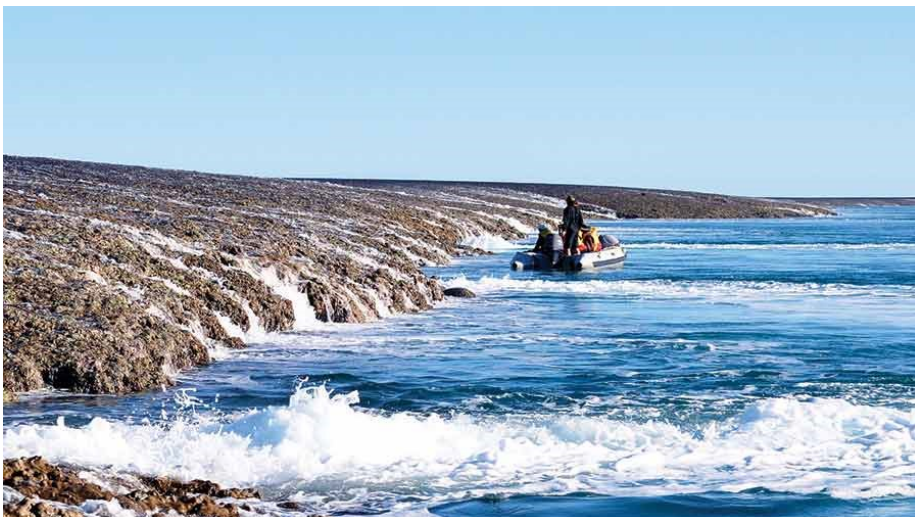
Left: Montgomery Reef exposed at low tide