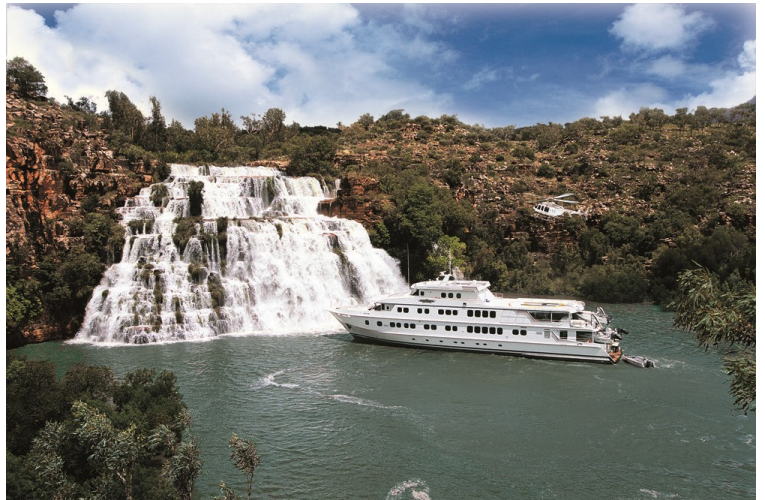
Above: King Cascade on Prince Regent River