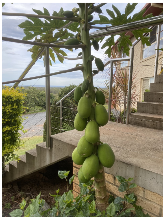
Below: Roger's Paw Paw tree