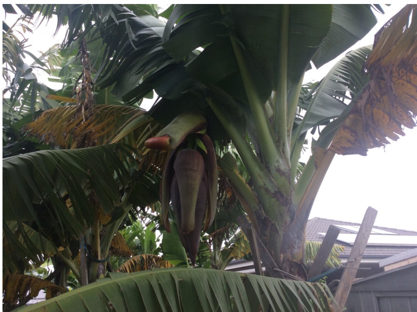
Above: Rob's banana tree