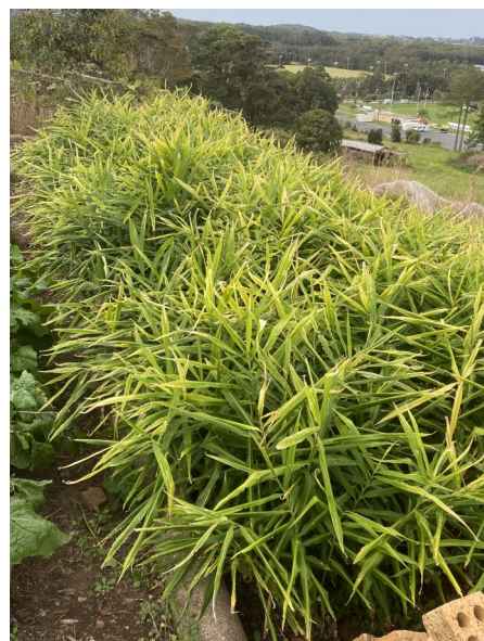
Above Right—Roger's ginger

Right: The aspirational shot—Ellis's soon to be garden bed