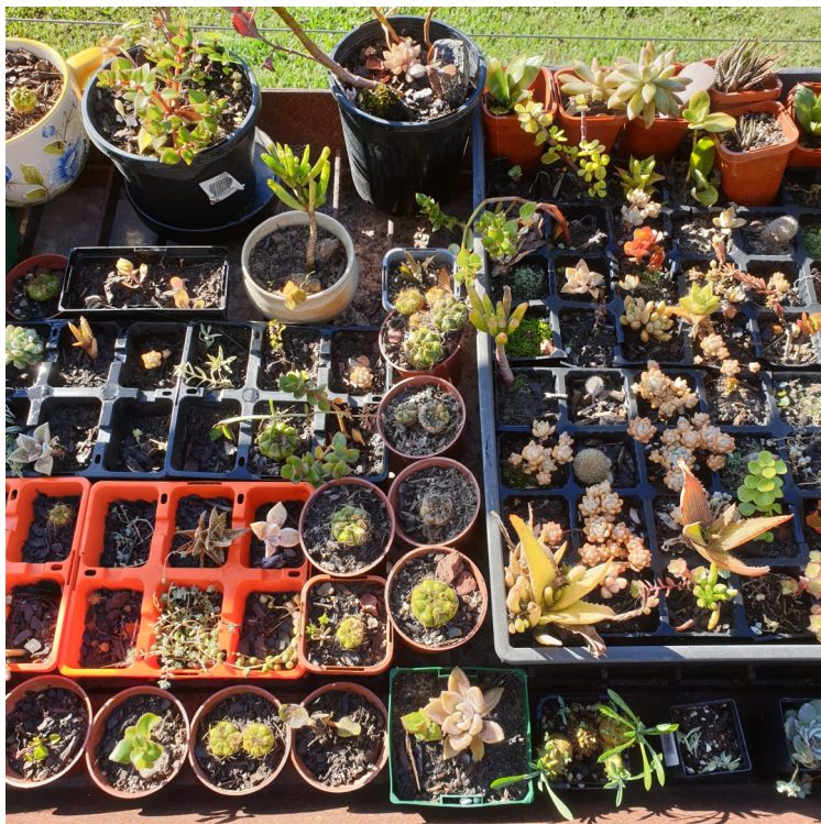
Above: Peter is preparing for a market stall