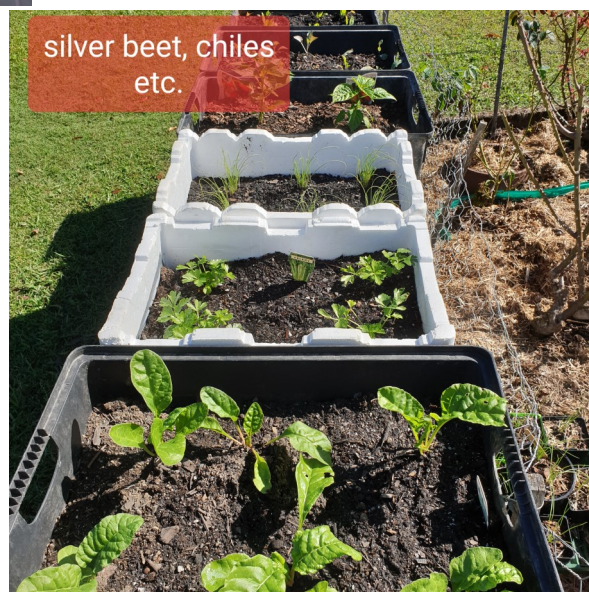
Below: Ellis's newly planted spinach, silver beet and eggplants