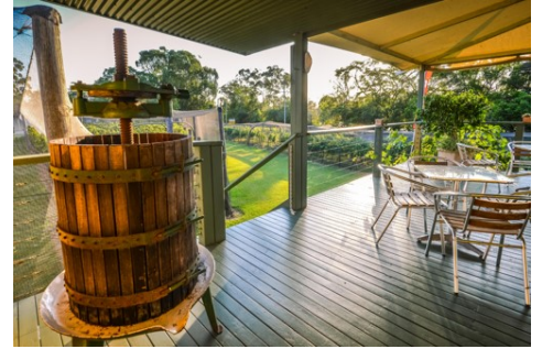
Above: Raleigh Winery—mark your diaries for 15 December.

to present the books at an assembly or speech night.