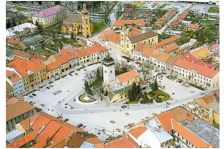
Above: Roznava, Slovakia, 18,000 people, surrounded by hills

Slovakia is renowned for its beautiful hills and mountains. There are many nearby