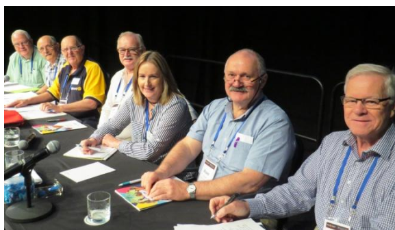
RAWCS Board members at AGM