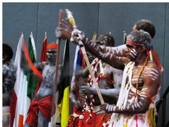
'One Mob, Different Country' dancers