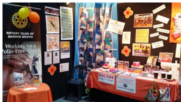
Days for Girls Darwin NT showcase booth