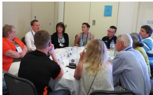
Discussion between Future Leaders.