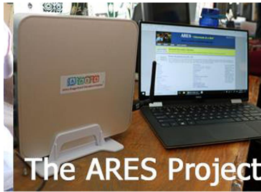
The ARES Project