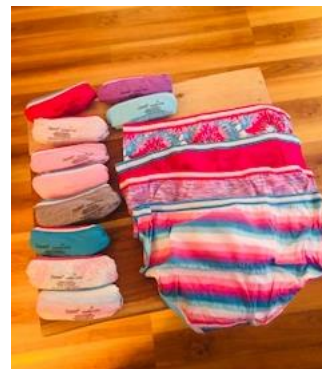
Pati – folding girl's underwear for Days for Girls