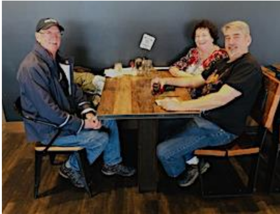
Pati --- sent out a Zeeks pizza Rotary fellowship for stateside Rotarians. Look who turned up.