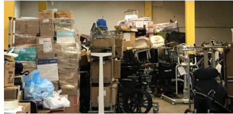
Photographer Patricia Sibley