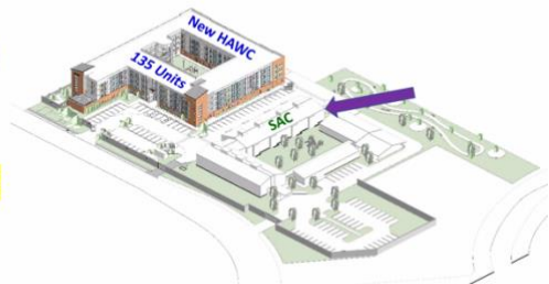
Ariel View of the New HAWC and SAC

With the Houston Area Women's Center (HAWC) pending move ... from their present campus operation into a (to be built) 135 Unit, more complete complex, on adjacent land ... their vacated building(s) can be reconfigured to support a Human (Sex) Trafficking SAC. (See attached illustration)