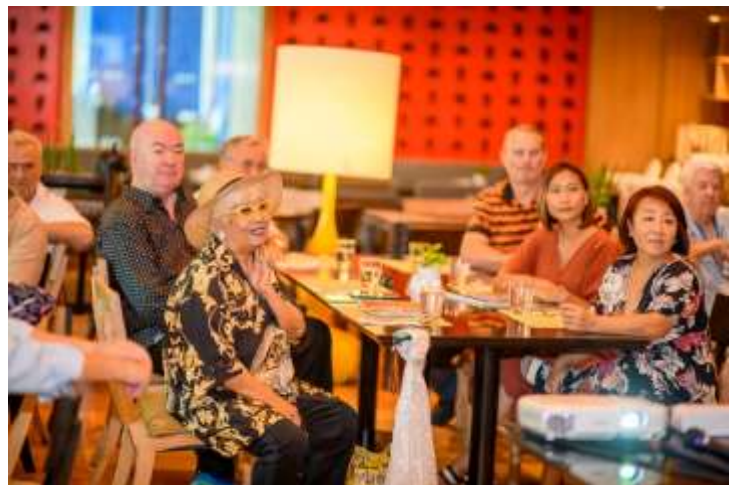
Sharing the Beauty, I see without Words.