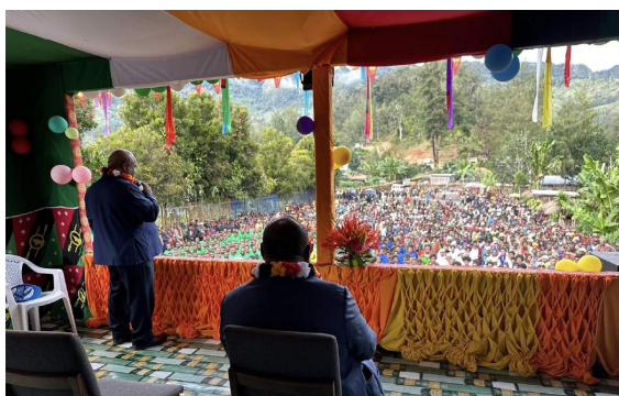
Above: Read on to find out what this event is for, who's speaking, and who took the photo.

TOAST to King Charles III and the People of Australia.