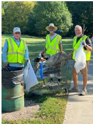
Annual Rotary Rubbish Roundup, May 18 2024.