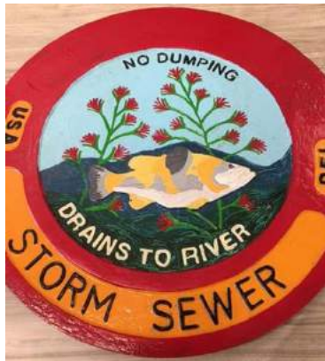
Storm water covers to be placed this year.

The Topeka Rotary Club also has a Foundation Similar to our own Public Ancillary Fund With in excess of USD 700,000.