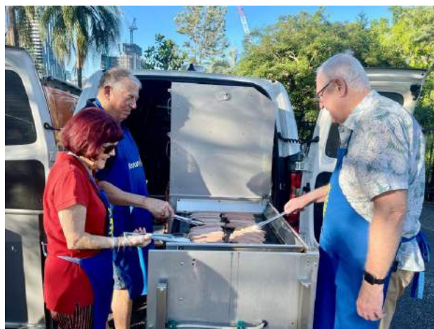
The barbeque rolls out of the back from the van. Cooking can begin within 5 minutes of the van being parked.