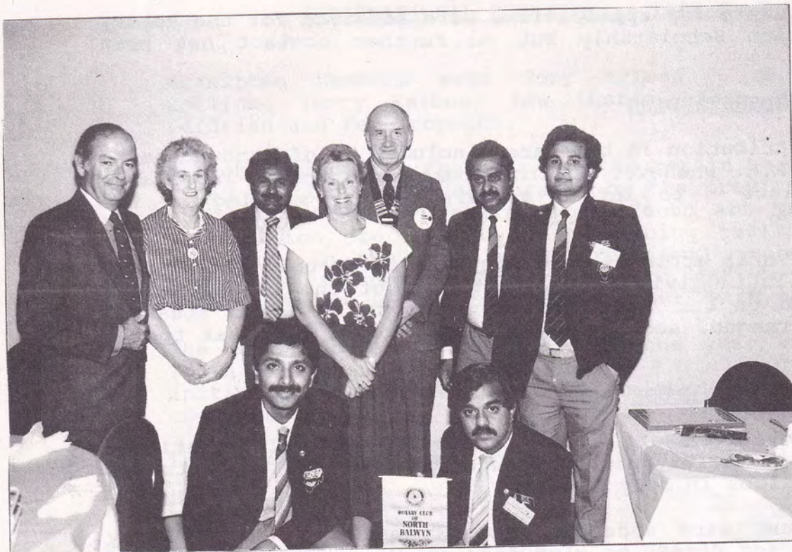
HOSTING THE INDIAN GROUP STUDY EXCHANGE TEAM