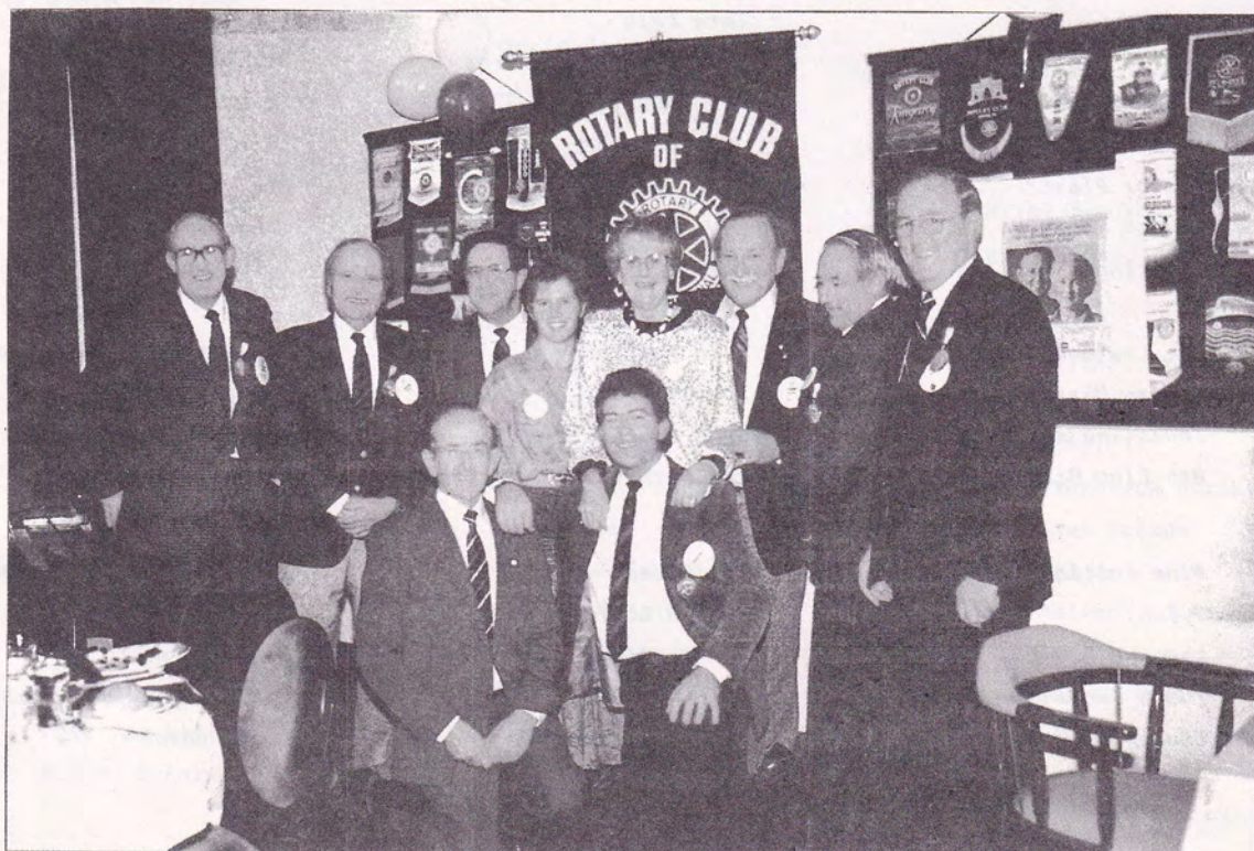
A GREAT WAY TO CELEBRATE A BIRTHDAY - CREATE A PAUL HARRIS FELLOW