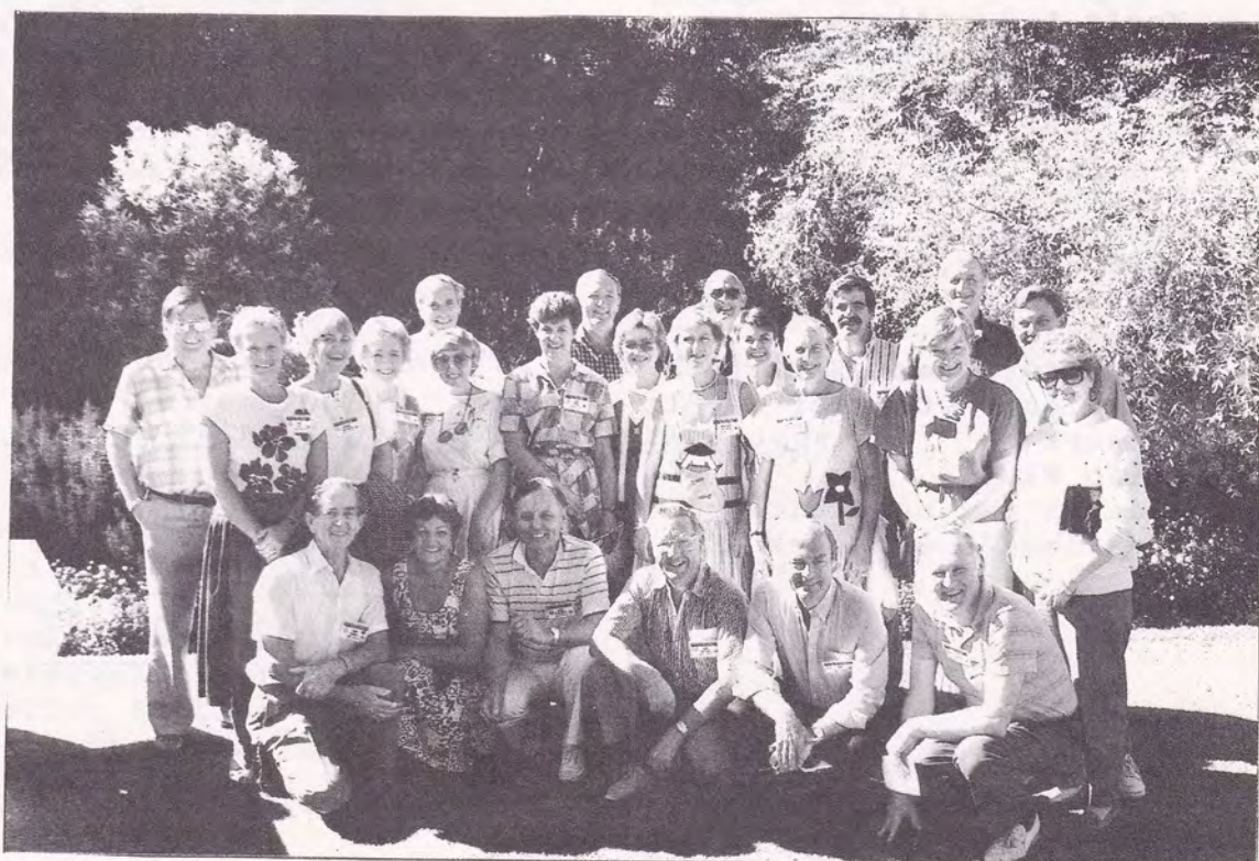
AT THE ALBURY DISTRICT CONFERENCE