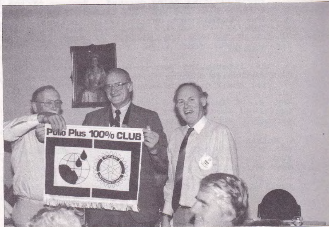
100% BEHIND THE PLAN TO IMMUNISE THE CHILDREN OF THE WORLD