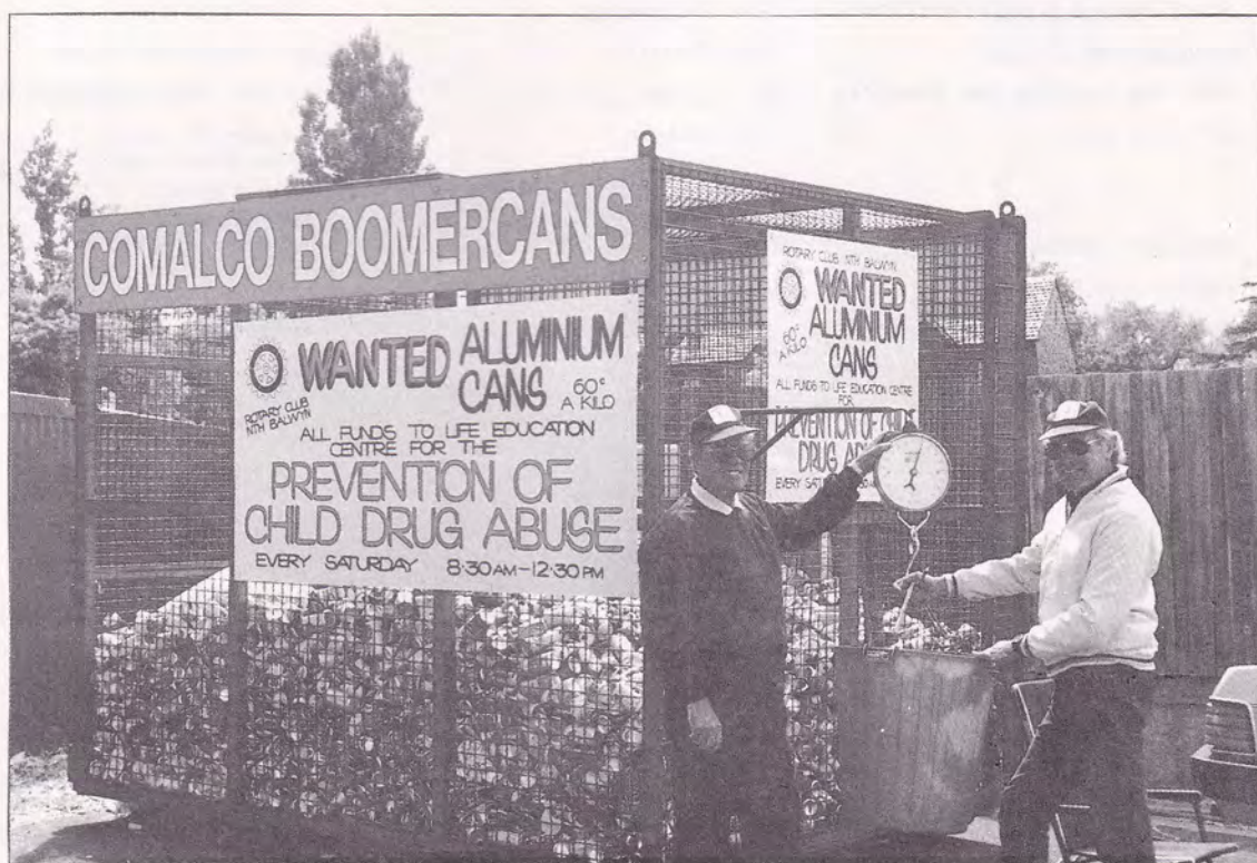
FUND-RAISING AND LEARNING ABOUT YOUR FELLOW ROTARIAN