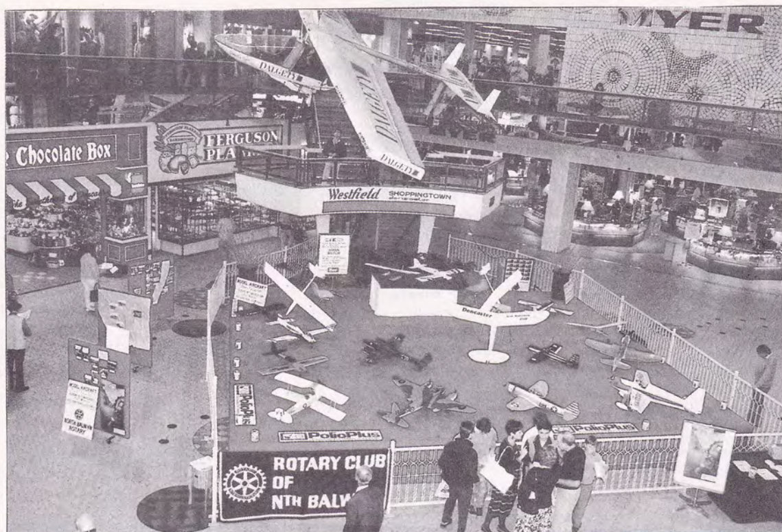
AEROMODELLERS DISPLAY AT SHOPPINGTOWN, DONCASTER