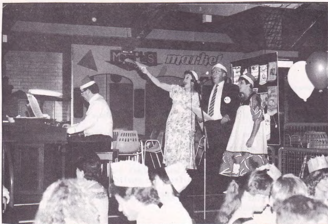
SINGING THE BLUES - 1988 CHRISTMAS FUNCTION