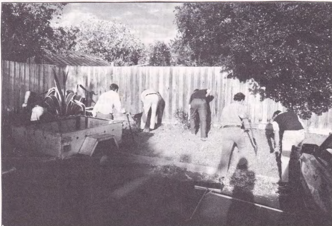
BENDING THE BACK - MARWALL AVENUE