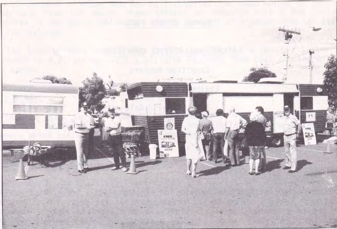
HEALTH SURVEY PROJECT