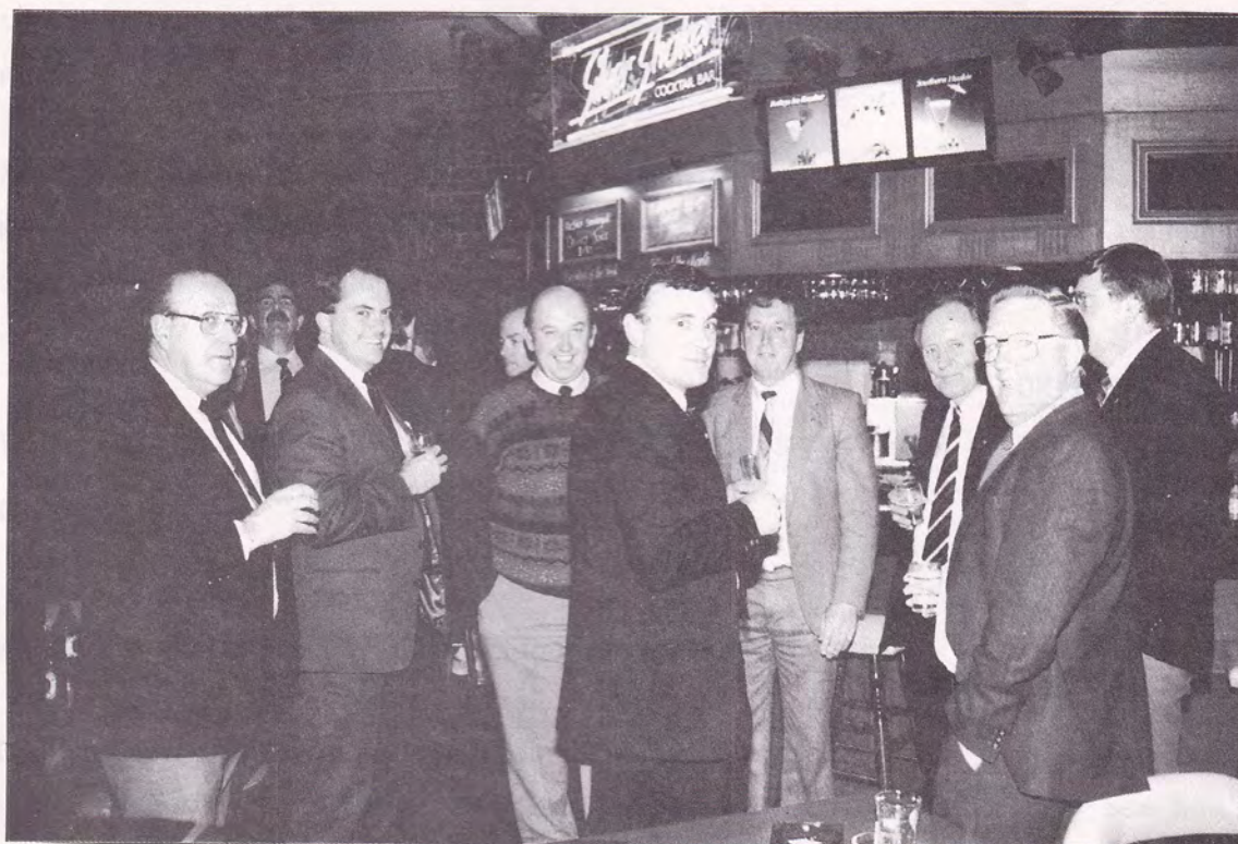
AT THE BAR