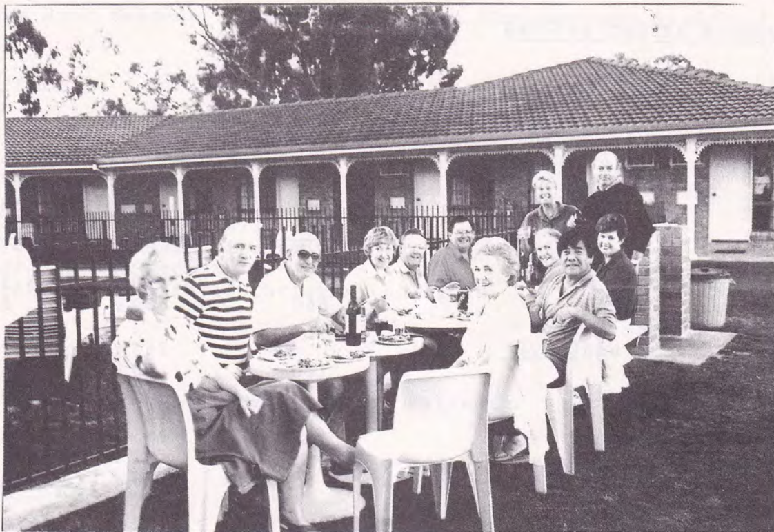
PRE DISTRICT CONFERENCE FELLOWSHIP