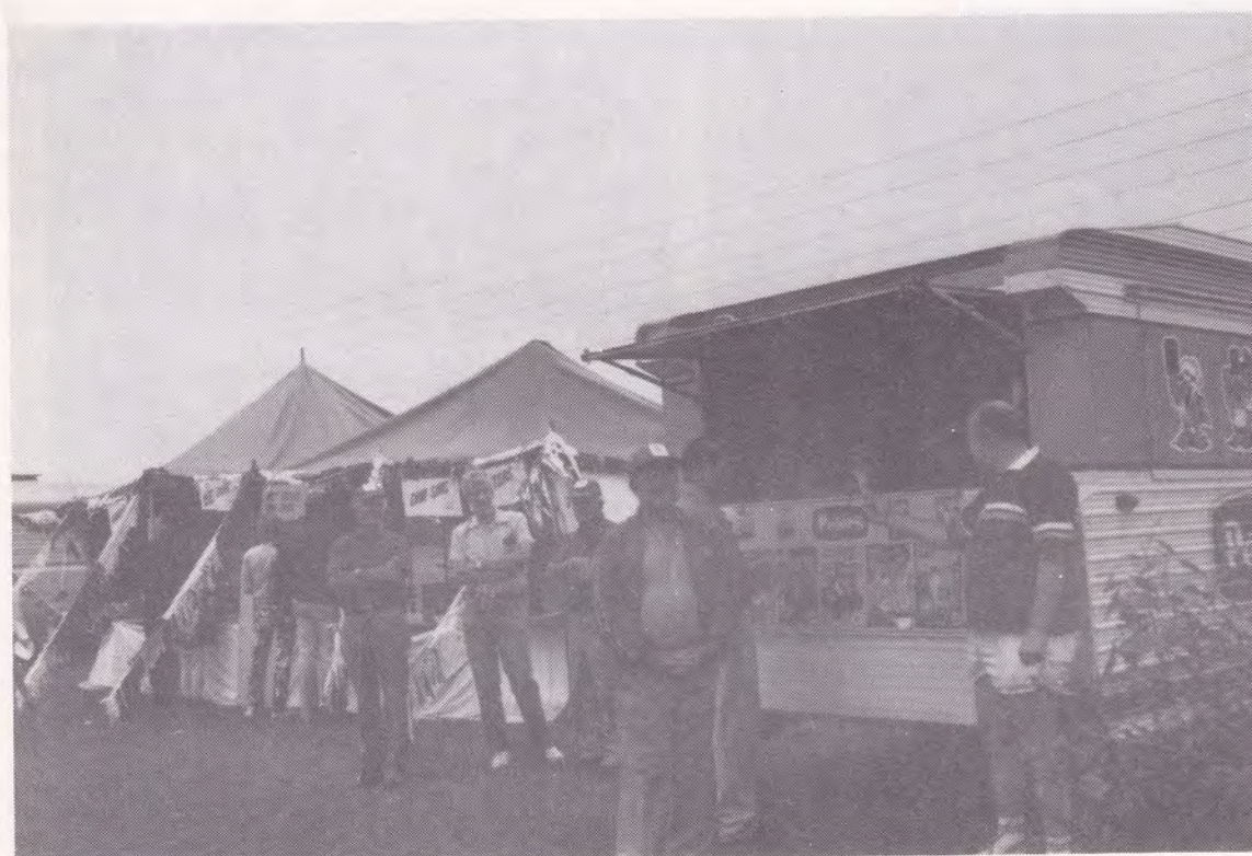
THE ANNUAL AEROMODELLERS DISPLAY