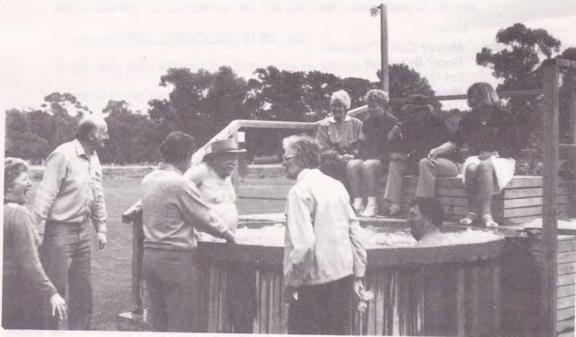
NOT A PRETTY SIGHT AT BAROOGA