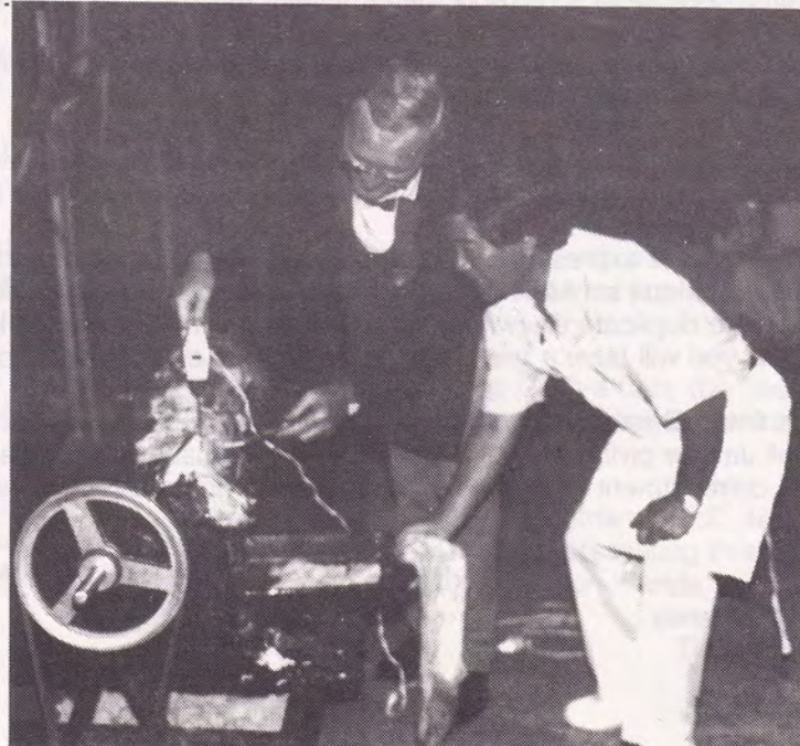
NEW YEAR EVE PREPARATION - THE MAGIC TOUCH.