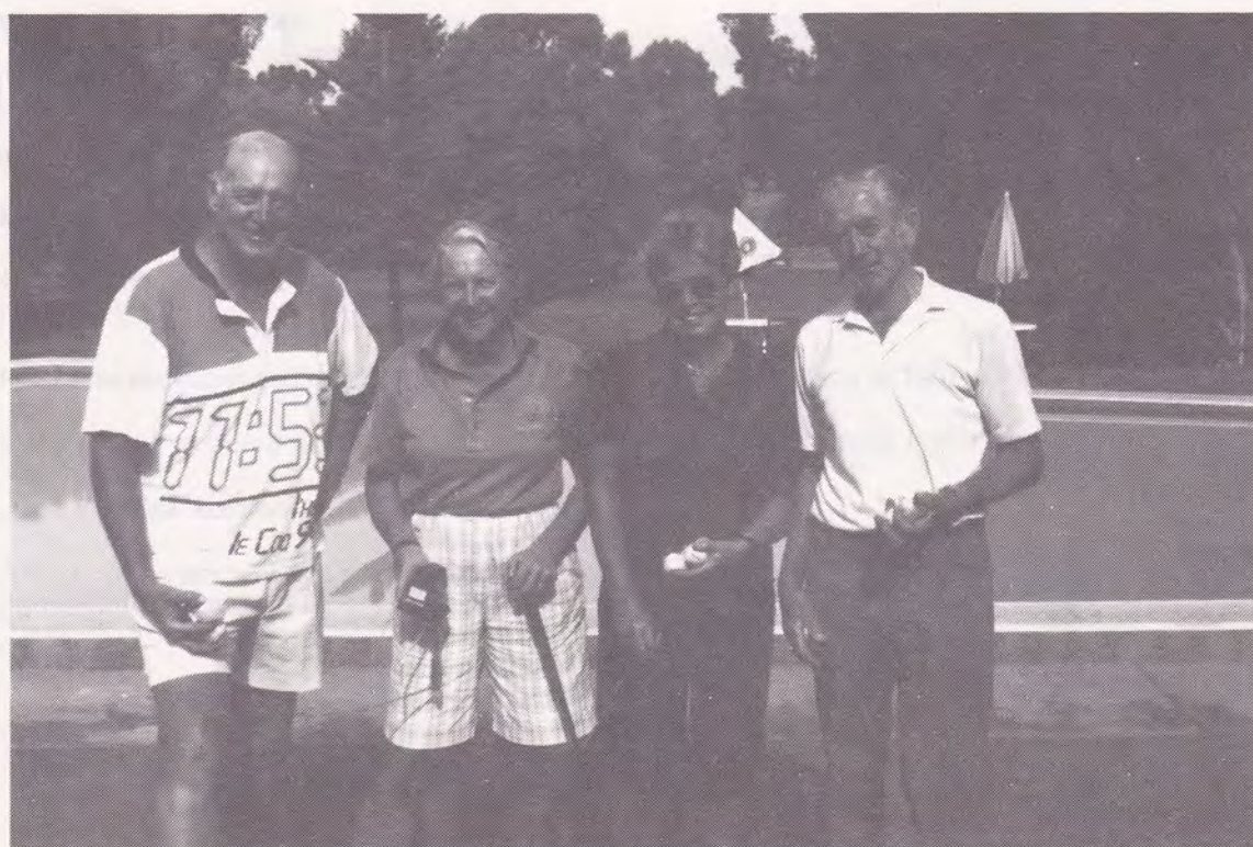
THE RENMARK WINNING FOURSOME