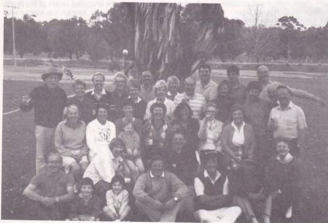
THE BAROOGA CROWD (FULLY CLOTHED)