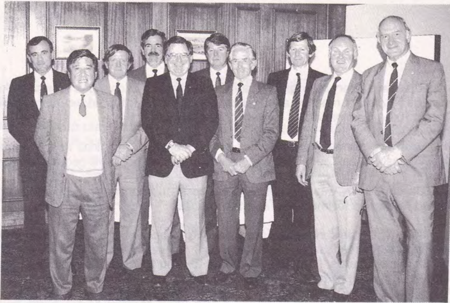
BOARD OF DIRECTORS 1988/89