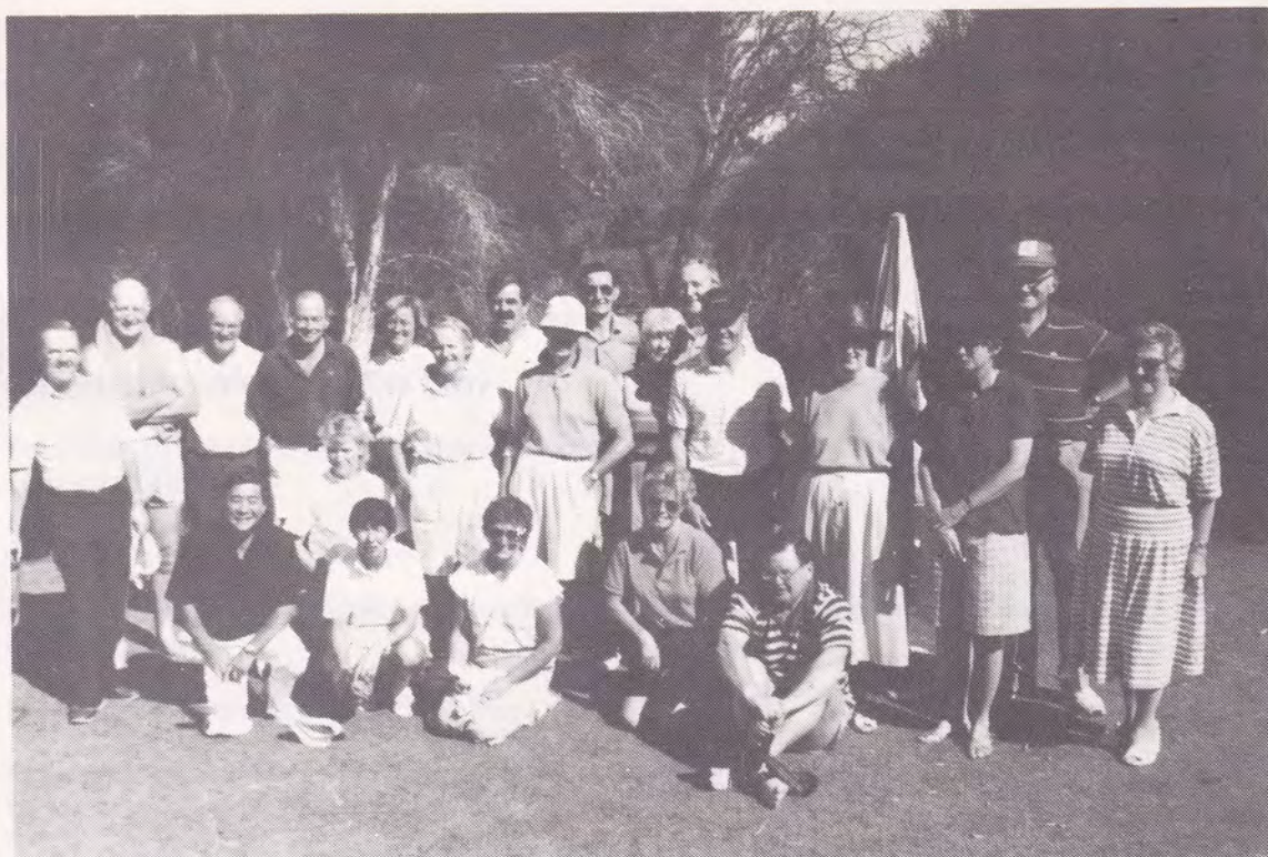
STUDYING ROTARY AT RENMARK ON WAY TO THE ADELAIDE CONFERENCE