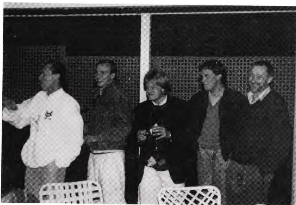
THE AUSTRIAN G.S.E. TEAM AT PLAY