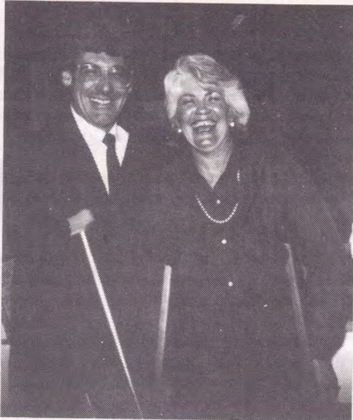
KEEPING THE ALMONER BUSY.