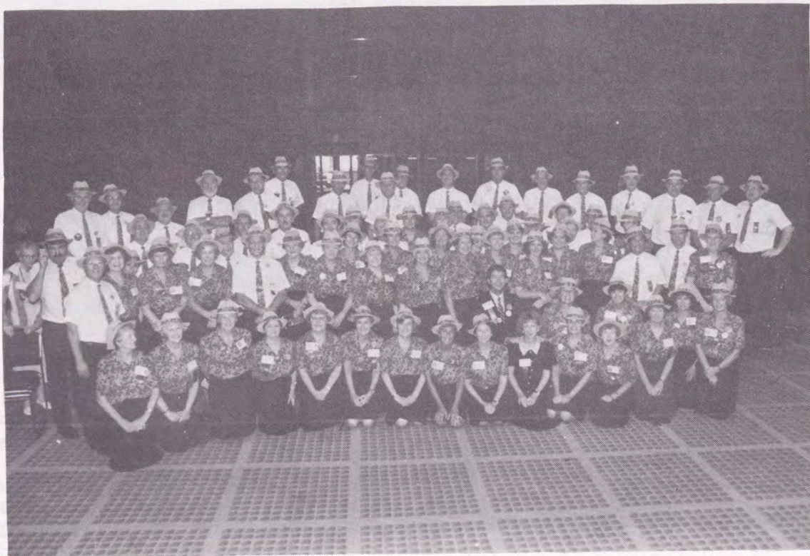
CLUB GROUP AT DISTRICT CONFERENCE