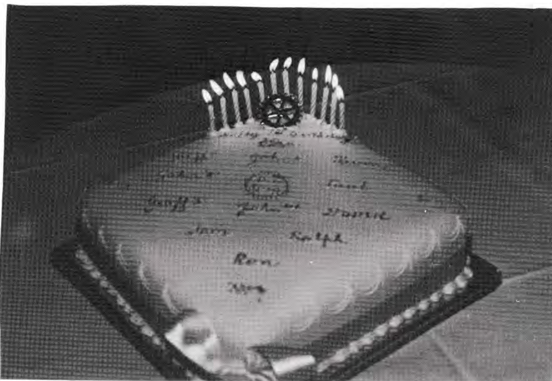
12TH BIRTHDAY CAKE