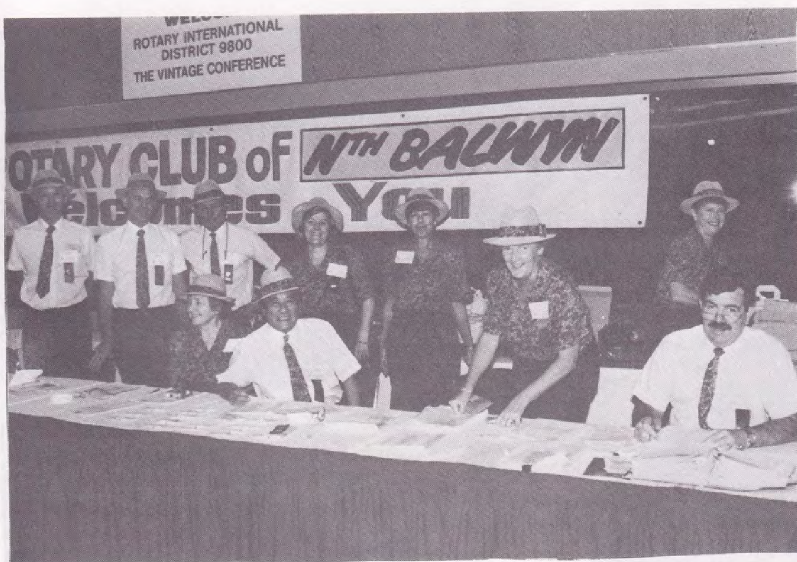
RECEPTION DESK AT DISTRICT CONFERENCE