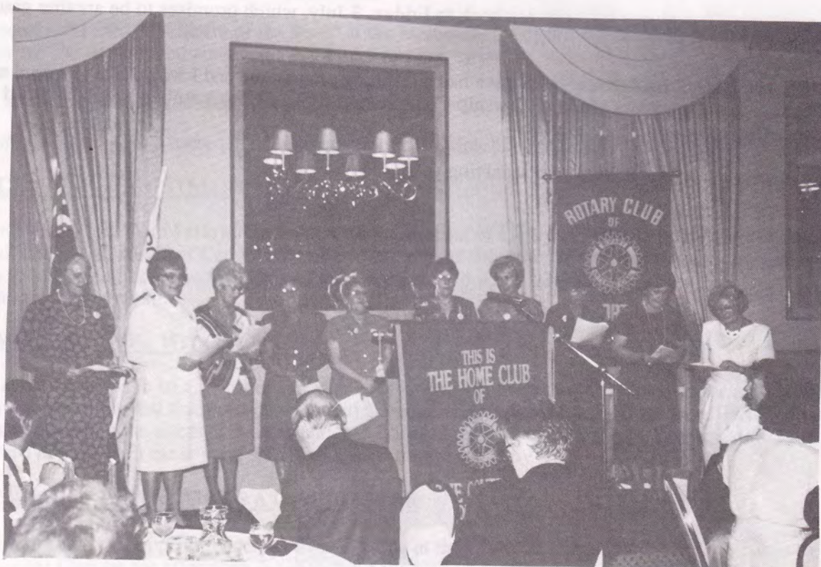
CLUB CHRISTMAS NIGHT 12 DECEMBER 1991 ENTERTAINMENT FROM THE "GRANDMOTHERS"