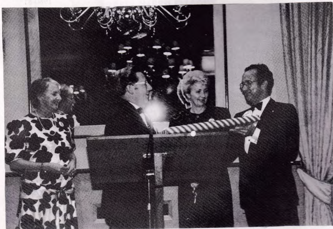
CHANGEOVER NIGHT 1991: