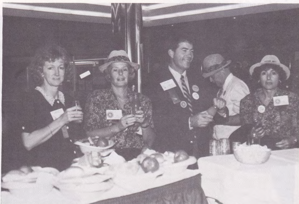
SATURDAY LUNCH DISTRICT CONFERENCE