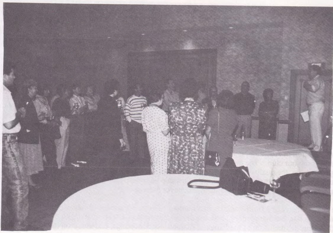
EARLY MORNING BRIEFING SESSION DISTRICT CONFERENCE