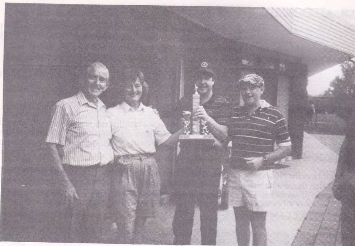
RICH RIVER WEEKEND OCTOBER 1991 - WINNERS OF GRAPEVINE HACKERS TROPHY