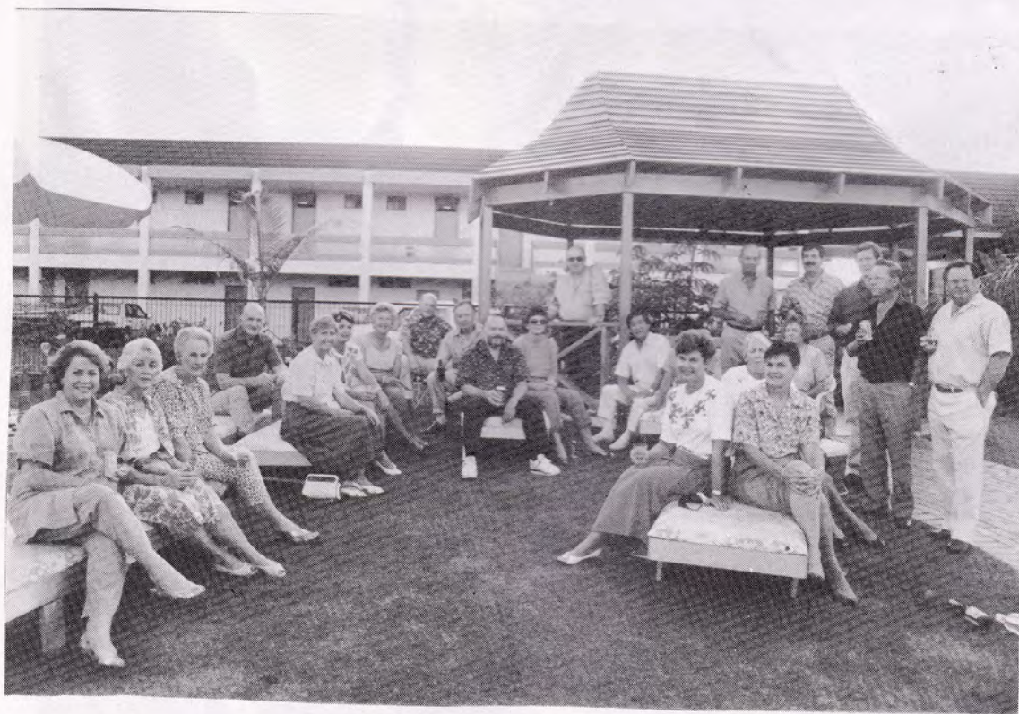
AFTER CONFERENCE "HOLIDAY" AT SWAN HILL