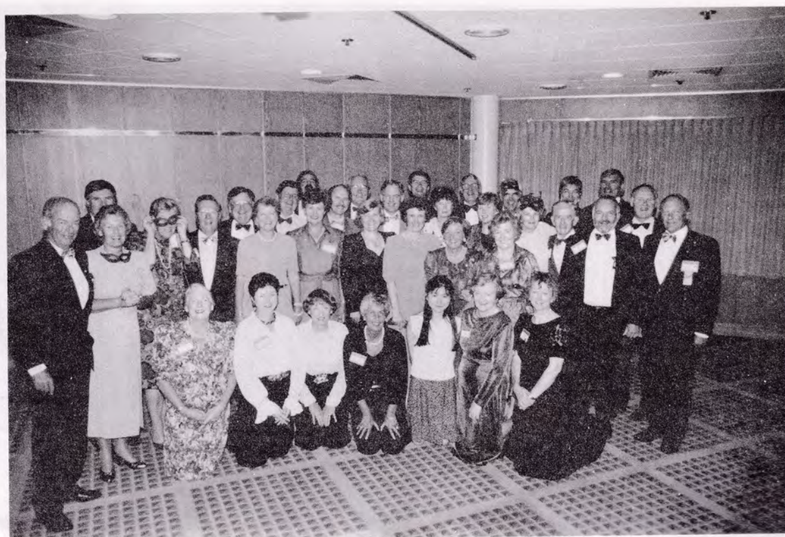
ON OUR WAY TO THE MASKED BALL DISTRICT CONFERENCE 1994