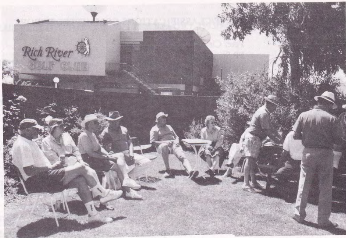
A GROUP OF HAPPY GOLFERS RELAXING AT RICH RIVER - NOV. 1993