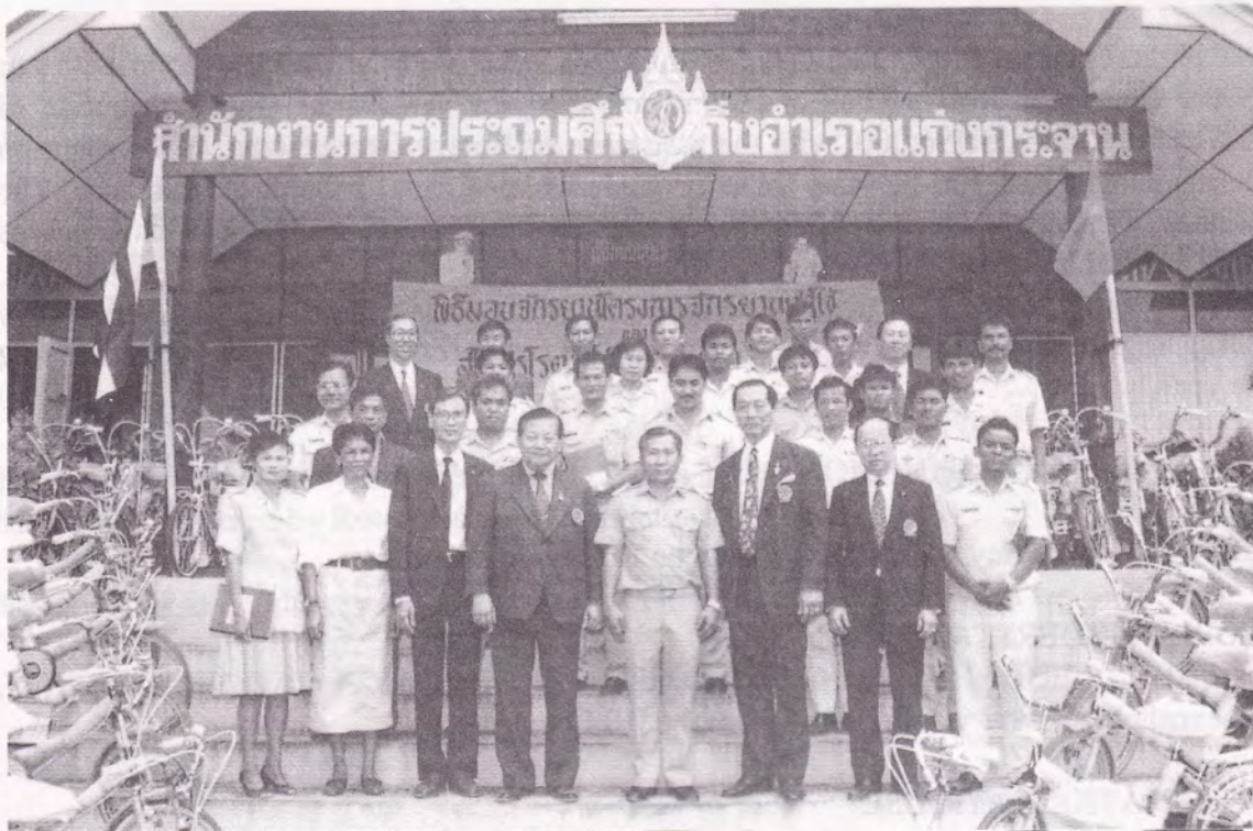
THE BICYCLE PRESENTATION CEREMONY WITH MEMBERS OF THE ROTARY CLUB OF PATUMWAN THAILAND AND OFFICIALS AND TEACHERS FROM THE MINISTRY OF EDUCATION