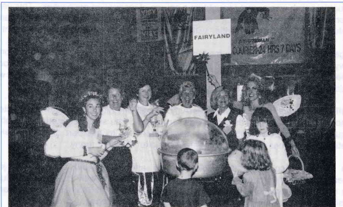
Our Ladies at the Variety Club Children's Christmas Party