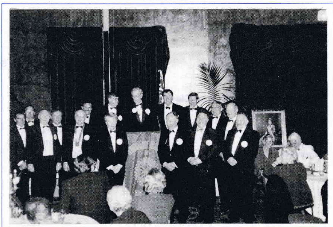
The Board and Office Bearers 1995-1996

District Governor Nominee / Horizons Committee Rotary Youth Programme of Environment (RYPEN) Rotary Foundation Director District Secretary Elect District Governors Group Representative Youth Exchange Committee Rotary Youth Leadership Award (RYLA) Rotary Youth Leadership Award (RYLA)