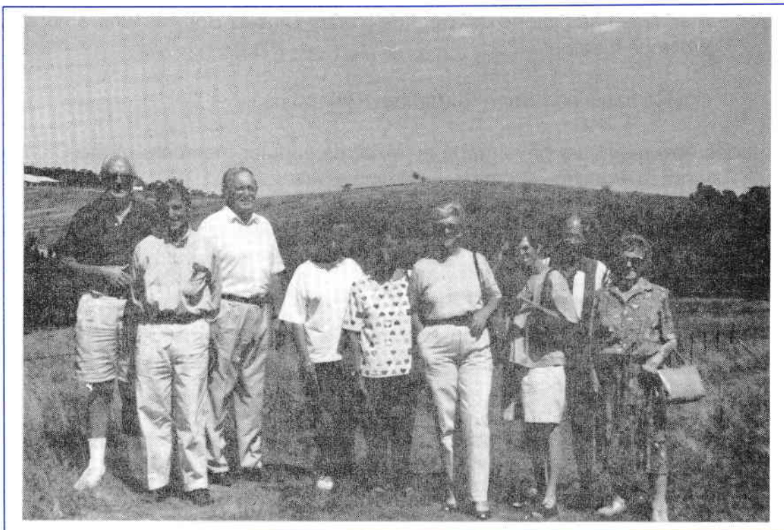
Relaxing At The Conference