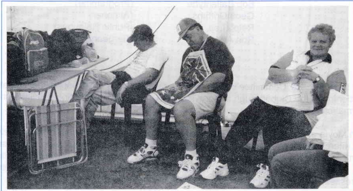
All Tuckered Out