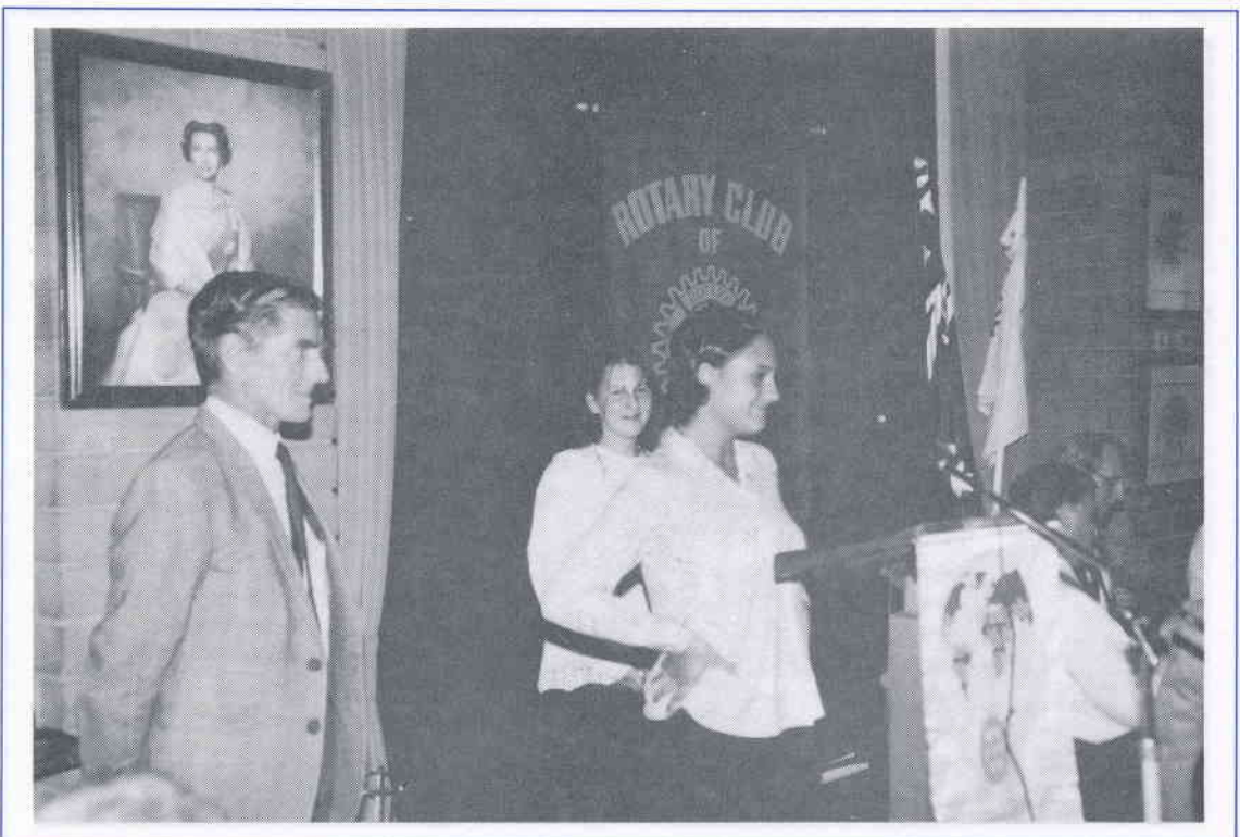
RYPEN Students Addressing Club