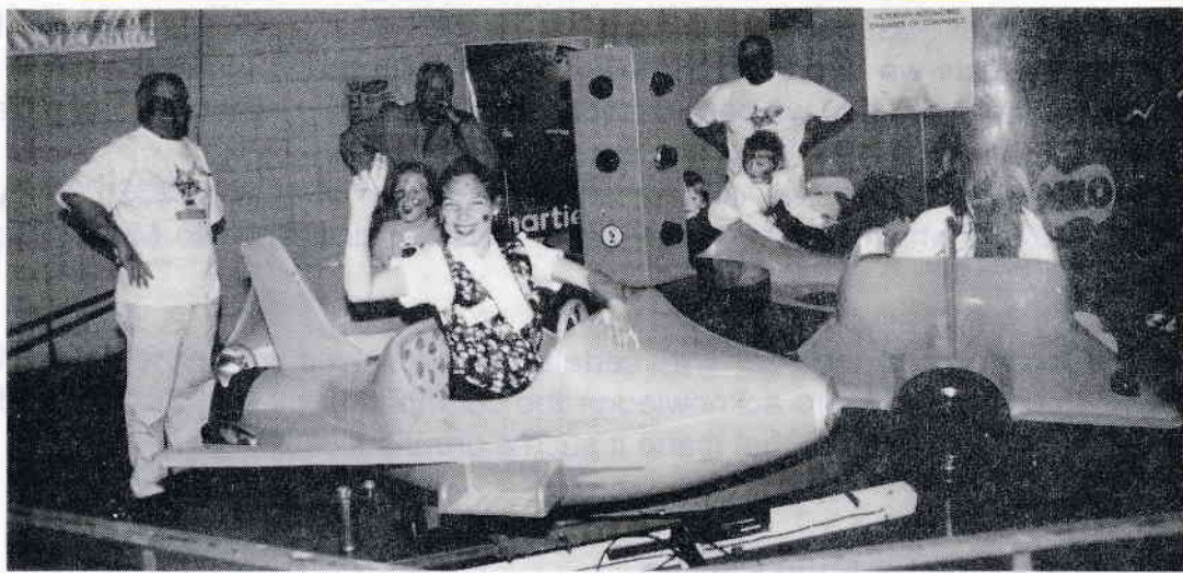
Variety Club Children's Christmas Party