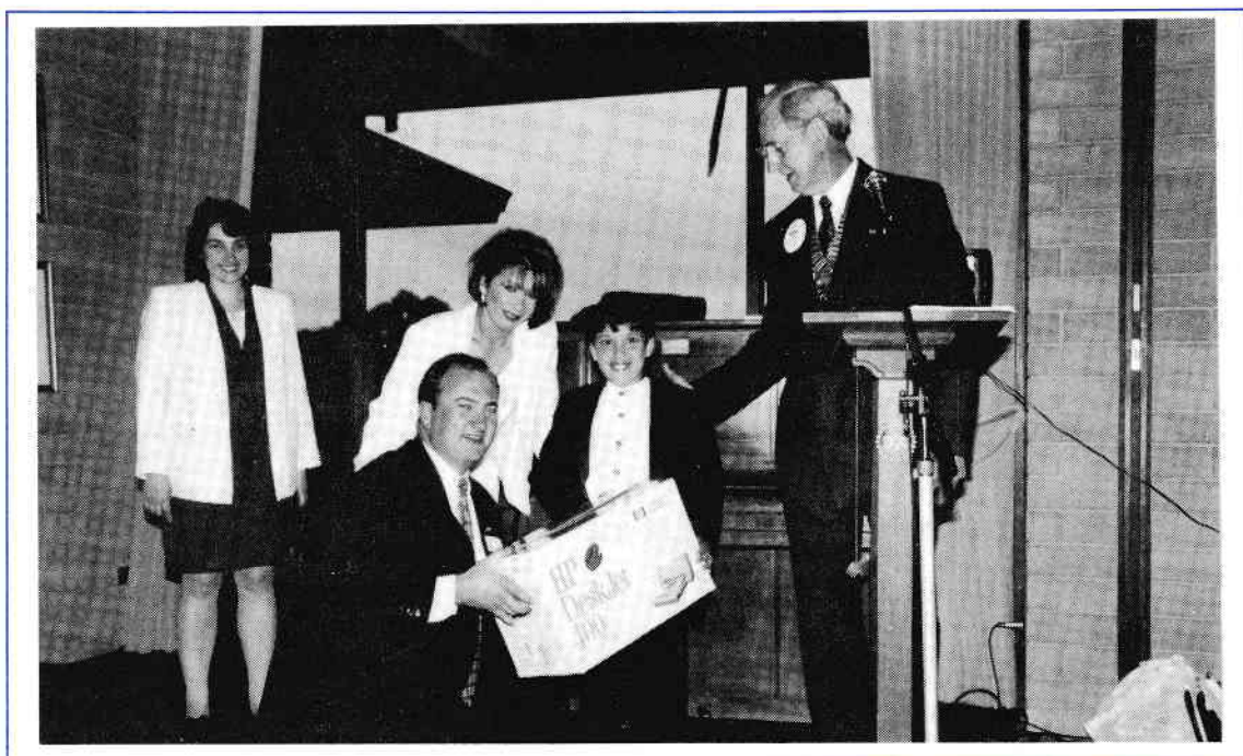
Rotary/Rotaract Laptop Computer Presentation