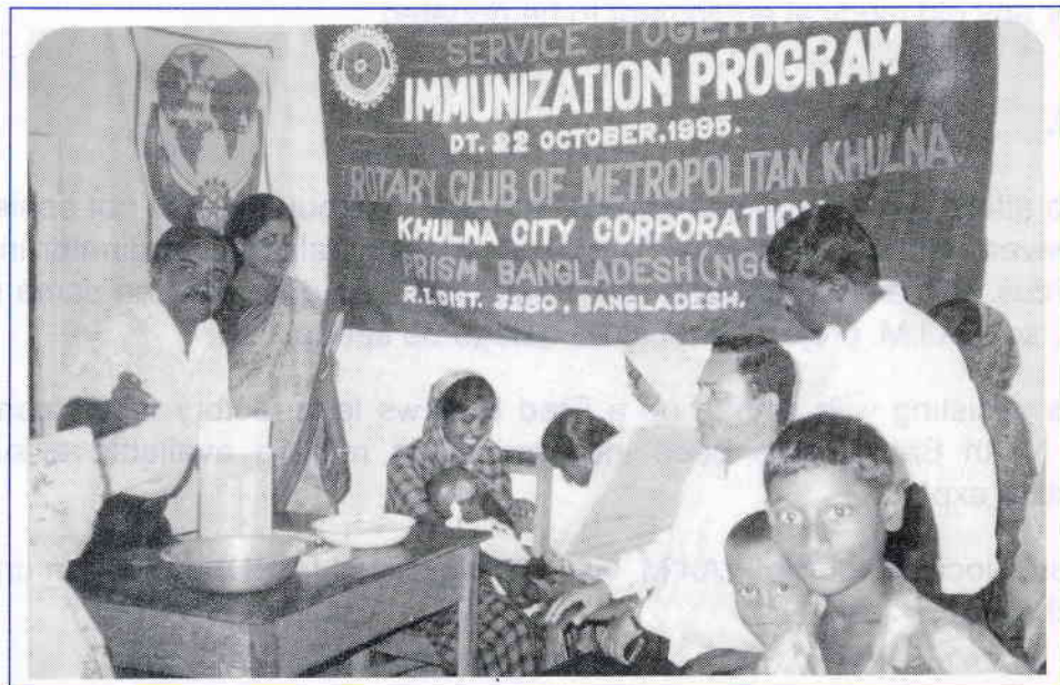
Rotary Club of Metropolitan Khulna - Bangladesh (Sister Club) MUNA