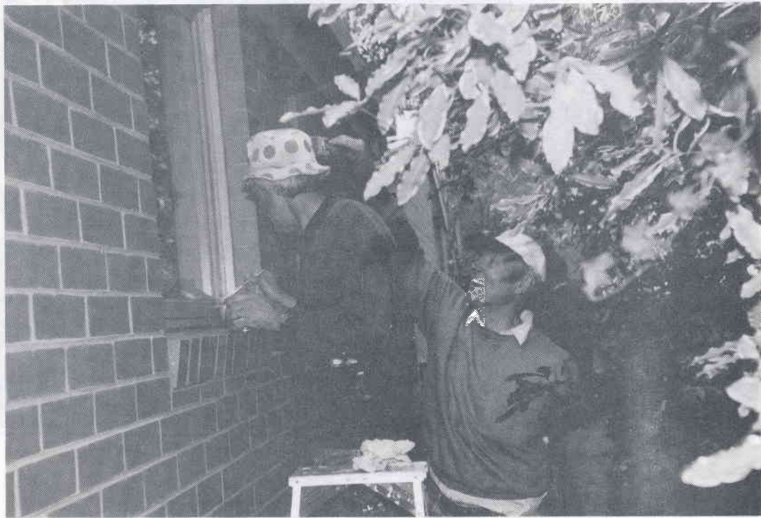
Paint Your Heart Out At Marwal Avenue