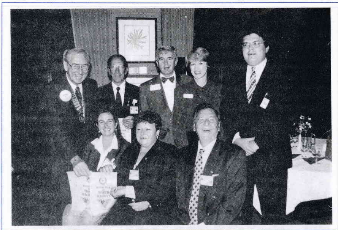
Farewell to GSE Team from Brazil

Awareness of the work in these areas has been maintained and strong reference to the need to encourage the continued use of immunisation programs has been given publicity in the Grapevine.