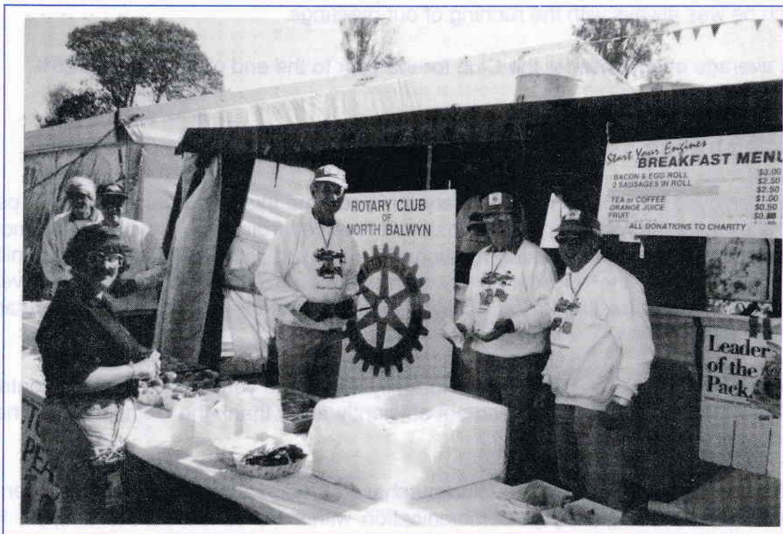
Grand Prix Breakfast