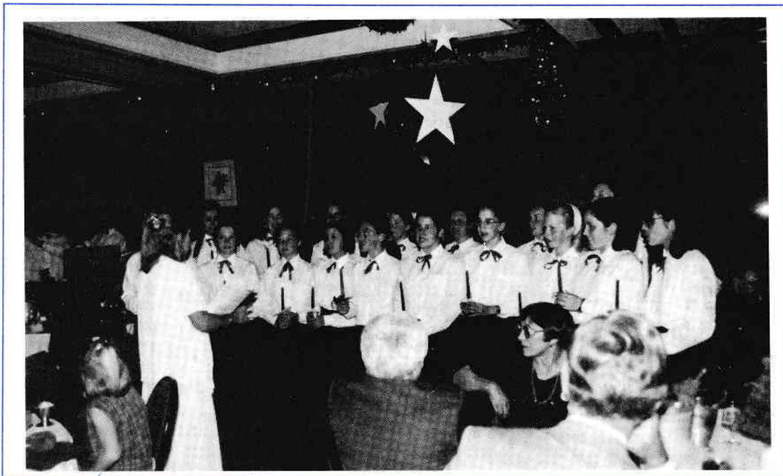
Entertainment by Balwyn High School