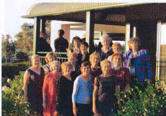
THE LADIES AT CANBERRA DISTRICT CONFERENCE