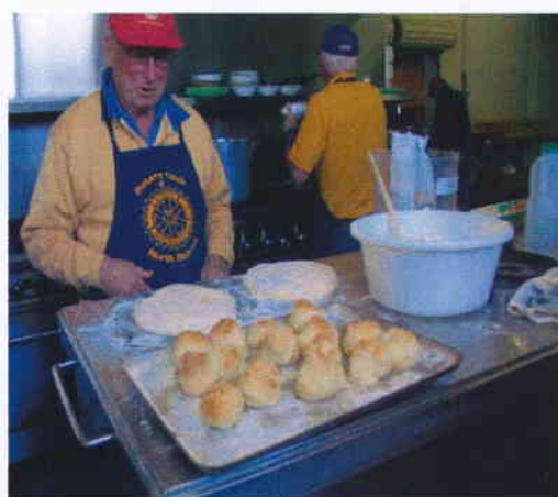
'I tell you, these are much, much, better than Nino's scones.'