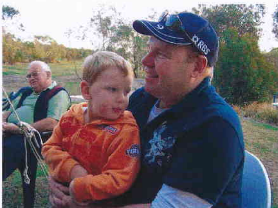
'Son, first it will be Interact, then Rotaract, then a busy Rotarian - just like Dad.'