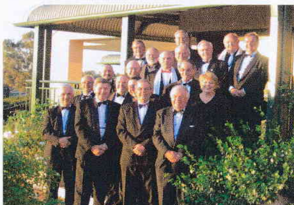
THE GENTLEMEN AT CANBERRA DISTRICT CONFERENCE