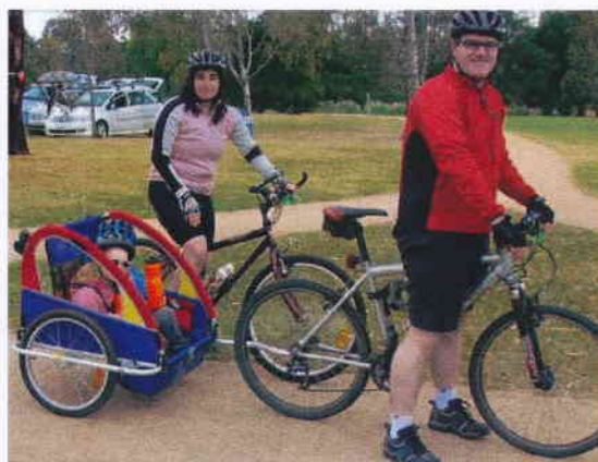
'That's strange, they were both in the trailer when we started out.'