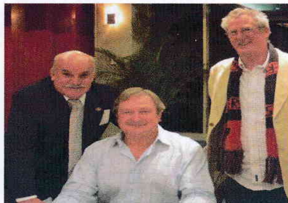
KEVIN SHEEDY WITH THE TWO SUCCESSFUL BIDDERS FOR A SEAT IN THE ESSENDON COACHES BOX.