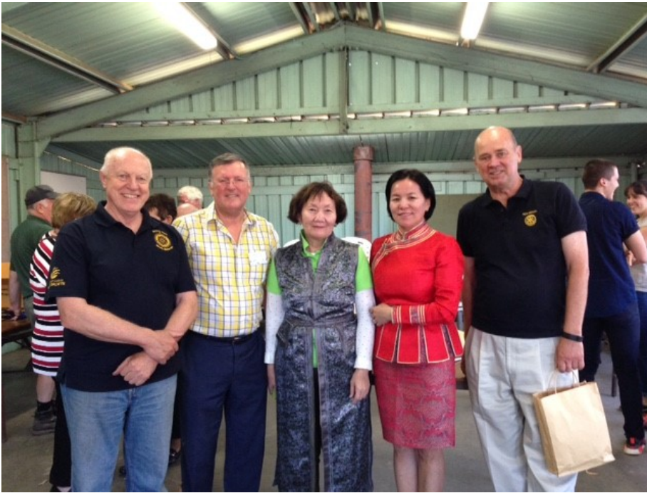
Mongolian Exchange Welcome