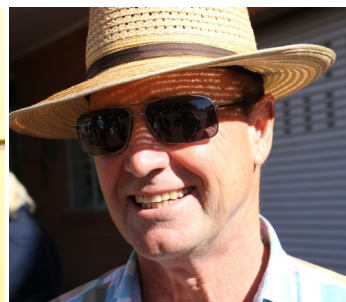
Fellowship Weekend in Albury