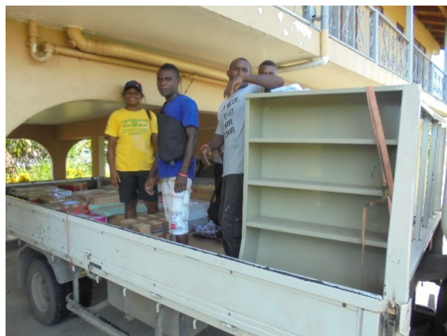
The contents of the container are being unloaded—The Solomon Islands