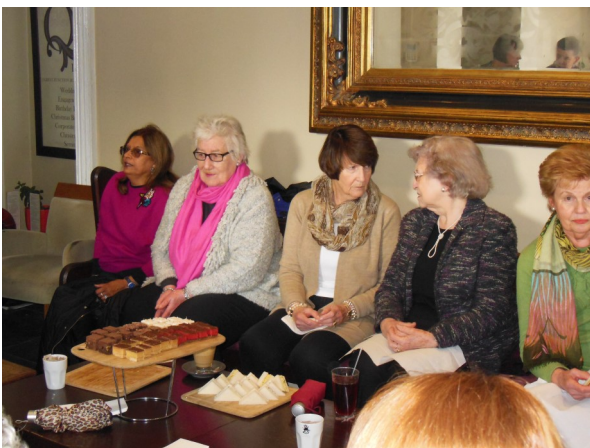
Partners Afternoon tea