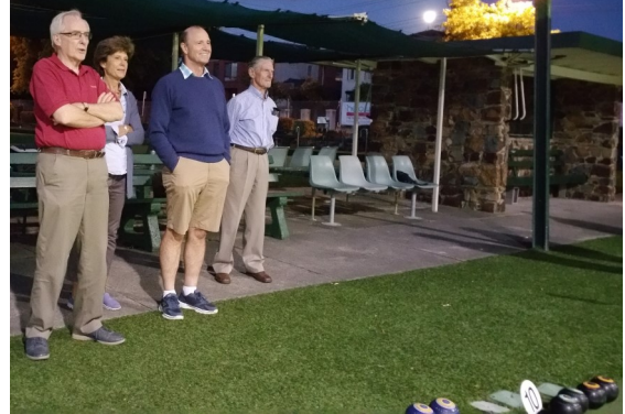
Enjoying the bowling night