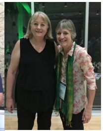
Attending the District Conference in Warrnambool