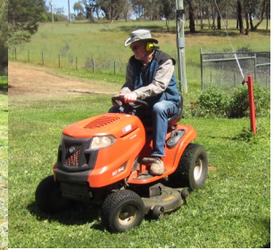
Working Bee at Camp Getaway