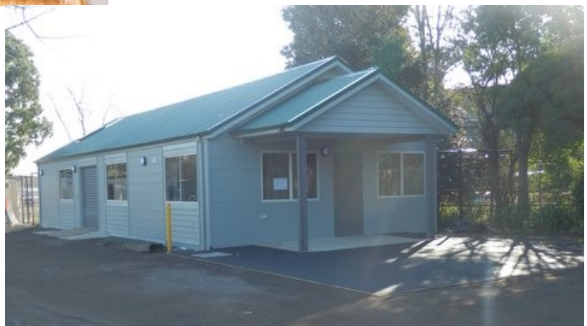
The Men's Shed