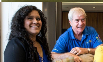
A most successful Golf Day