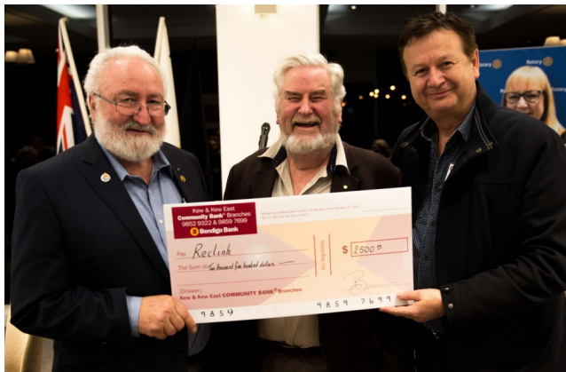
Donations to Reclink and IMPACT for Women

Some of the activities included in "Other Fundraising" include the Christmas Fare, Sales of various items, Donations to various campaigns, Silverpot collections, Donations from the Interact Club and Members and smaller fundraising activities.