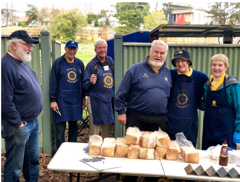
Catering for Longevity in Kew

It is worth reflecting that each fundraising event obviously raised funds, but also afforded us the opportunity of Fellowship while doing the work.