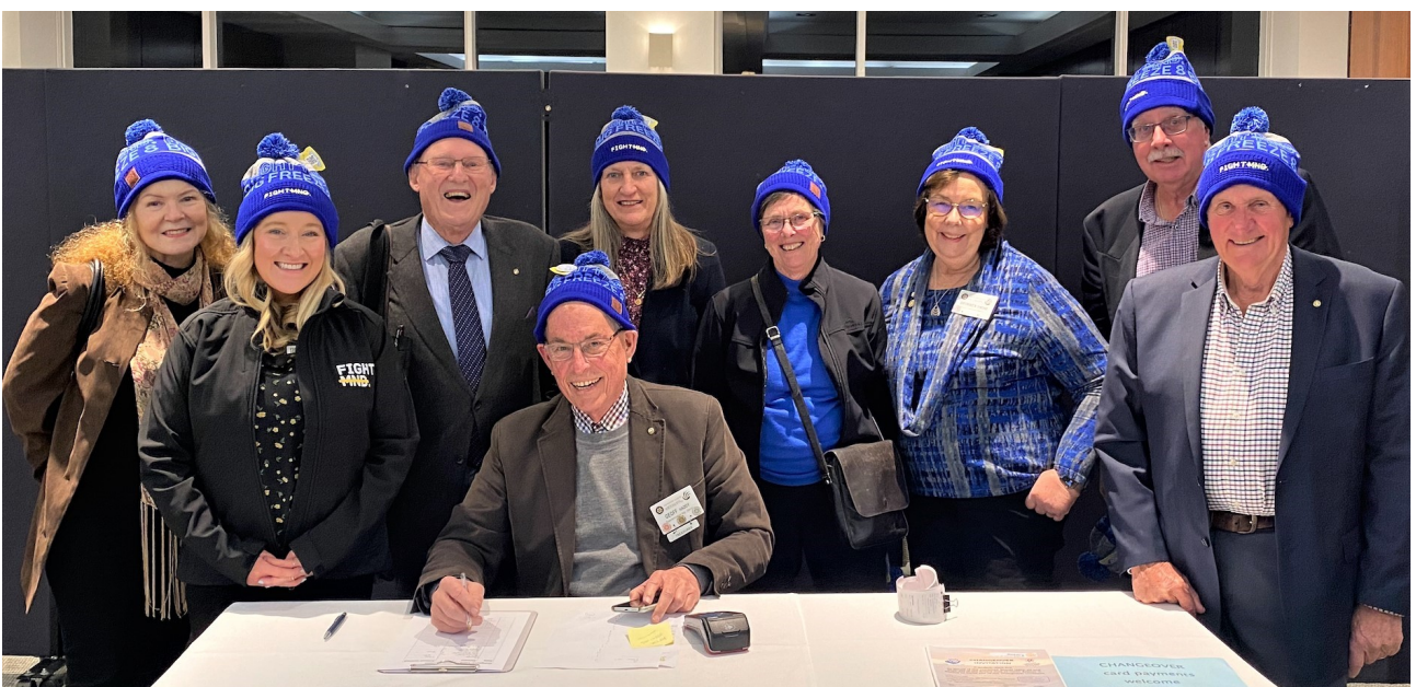
Fight MND beanies!!