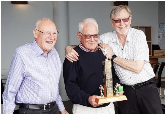
Winners in Golf at the Fellowship Weekend.