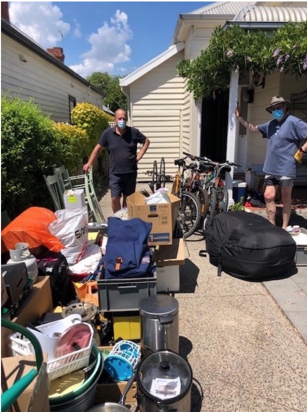
Donations to the Afghan Refugee Program