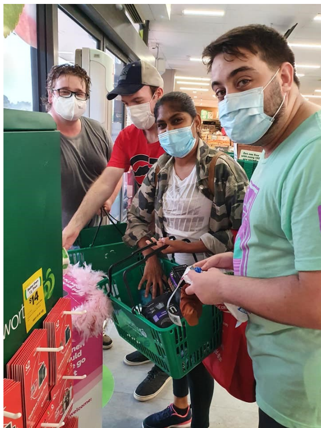
The Rotaractors participated in "Share the Dignity" project and purchased sanitary items to donate to disadvantaged women.