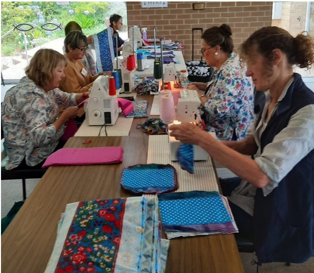
A busy sewing day

The sewing days continue on the first Tuesday of each month at the Uniting Church in Duggan Street and the group is very grateful to be able to use this space.