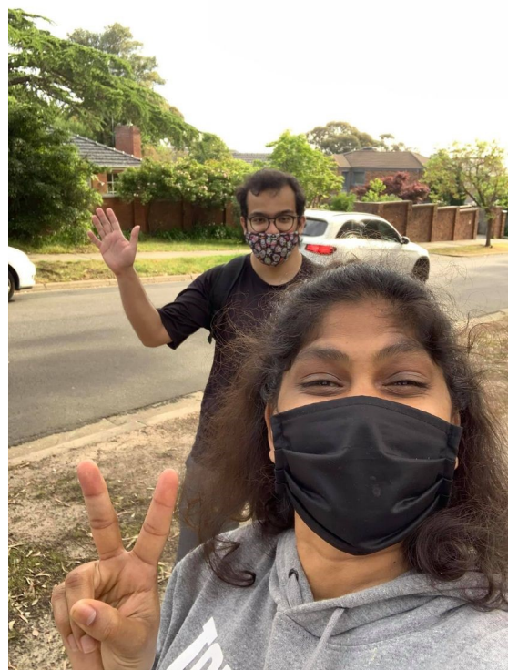
The Rotaractors participated in the End Polio virtual walk in October.