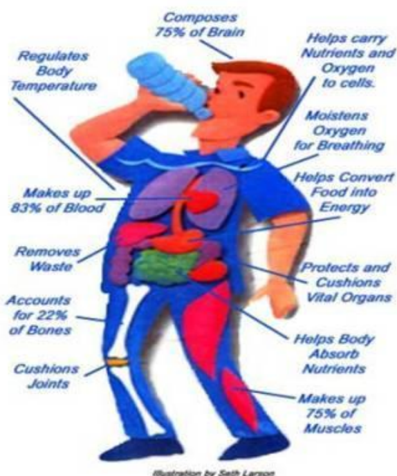
Illustration by Seth Larson