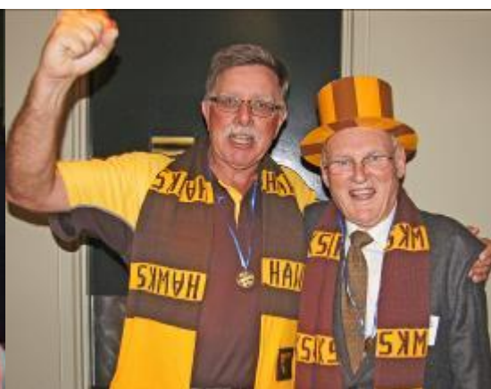
The Mighty Hawks!

Many thanks to the Fellowship Committee for such a wonderful night!!!