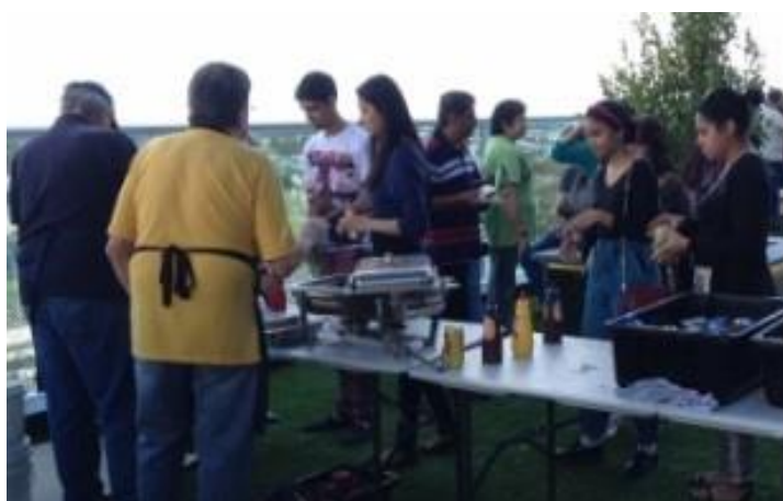
Near the finish of the day and we were down to the last of the drinks