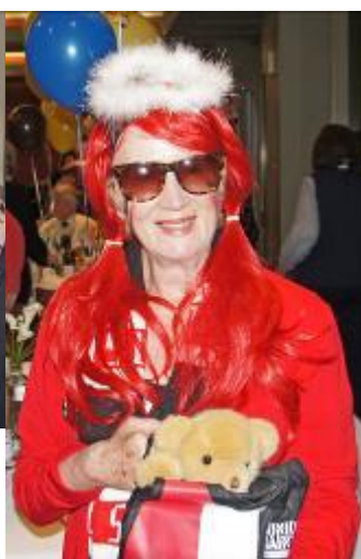
Fan of the Year!