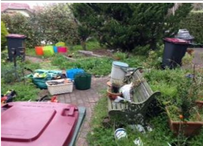
Orrong Cres last Fri - 3.45pm - "Before"