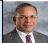
RI President K. R. Ravindran