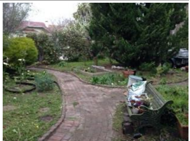
Orrong Cres last Fri 5.45pm - "After"