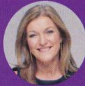
Fiona Patten MP