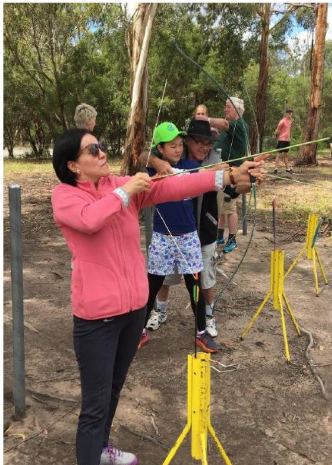
Clifford Park - Aussies teaching archery to Mongolians – January 2018