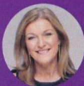
Fiona Patten MP