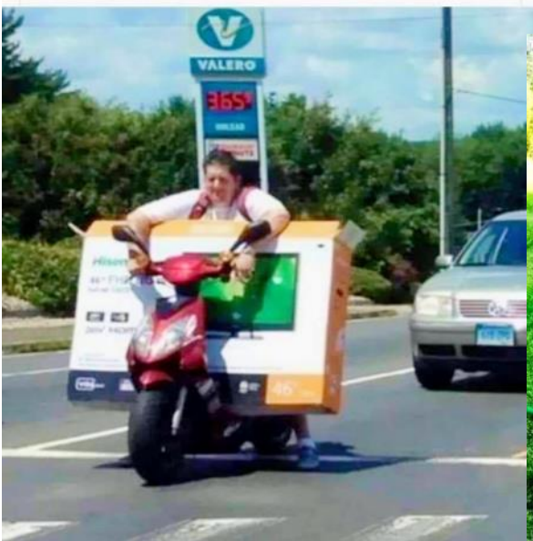
First sign of stimulus checks