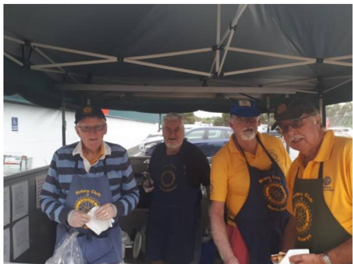
The team at Bunnings on Friday. Well done team.