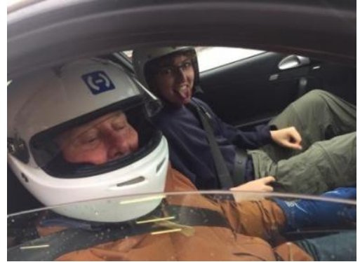
A Rotoractor having a passenger ride at the Maserati track day

Last Saturday we catered for the official opening of the Balwyn Community Centre; on Halloween night we held a BBQ outside ALDI, Greythorn as part of Halloween and Saturday 2 nd November we will be at the Maserati Club drive day at Sandown Raceway. For Maserati owners there will be Driver Tests Sessions with an experienced Maserati Club Member, Track Sessions with an experienced Club Member, Passenger Rides, and opportunity to try entry level Motorsport and learn more about your driving skills and car! ..... and coffee, salads and BBQ foods from Rotary!