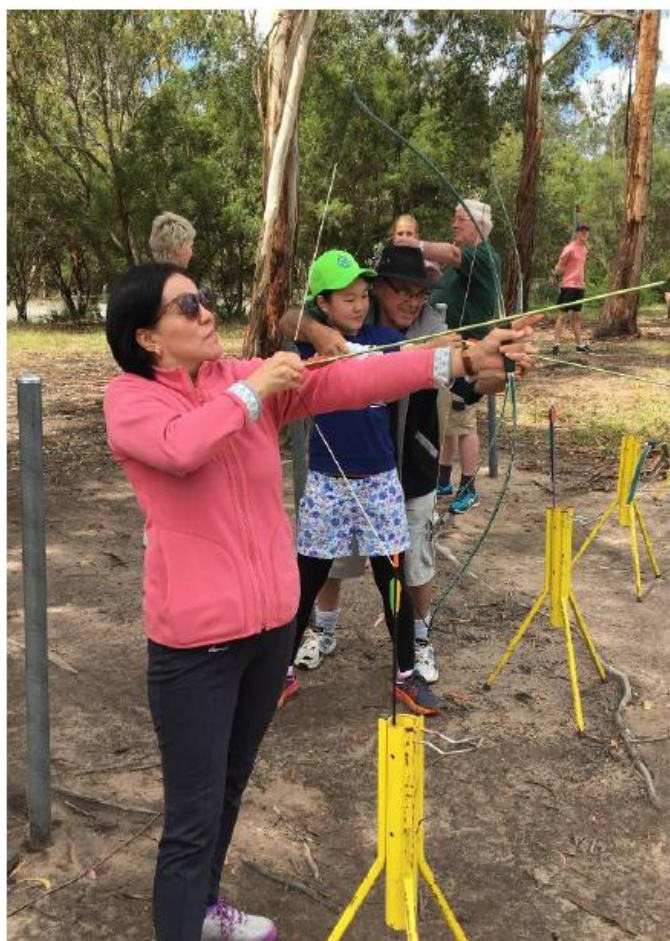
Clifford Park - Aussies teaching archery to Mongolians – January 2018