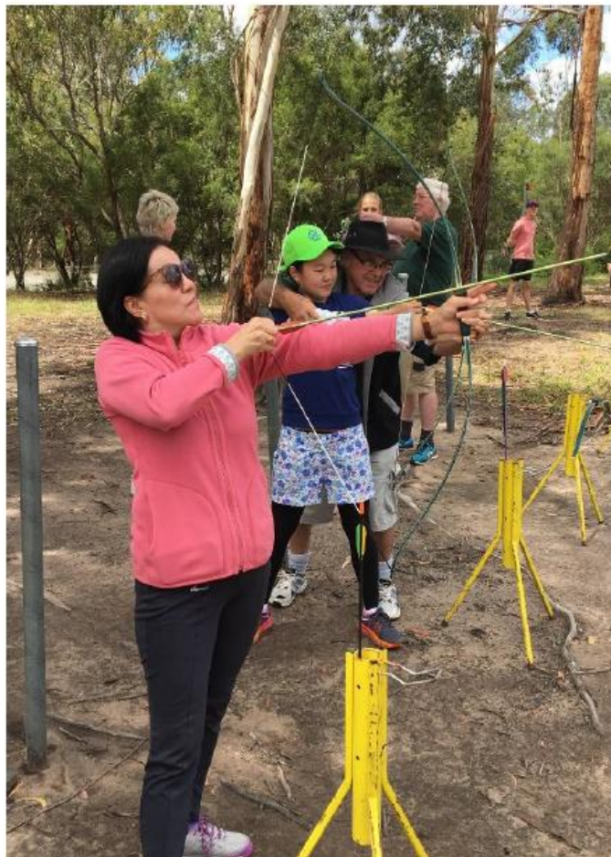
Clifford Park - Aussies teaching archery to Mongolians – January 2018