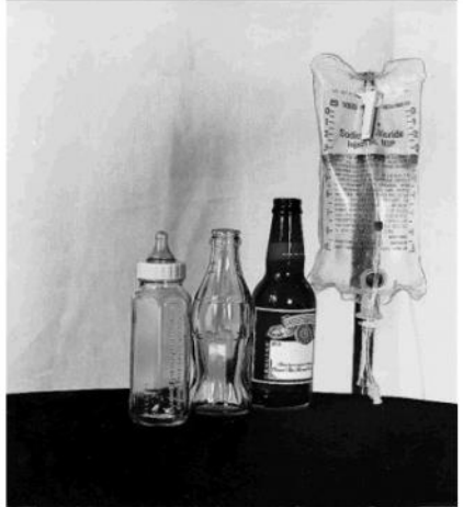
4 stages of life!

GONNA ASK MY MOM IF THAT OFFER TO SLAP ME INTO NEXT YEAR IS STILL ON THE TABLE