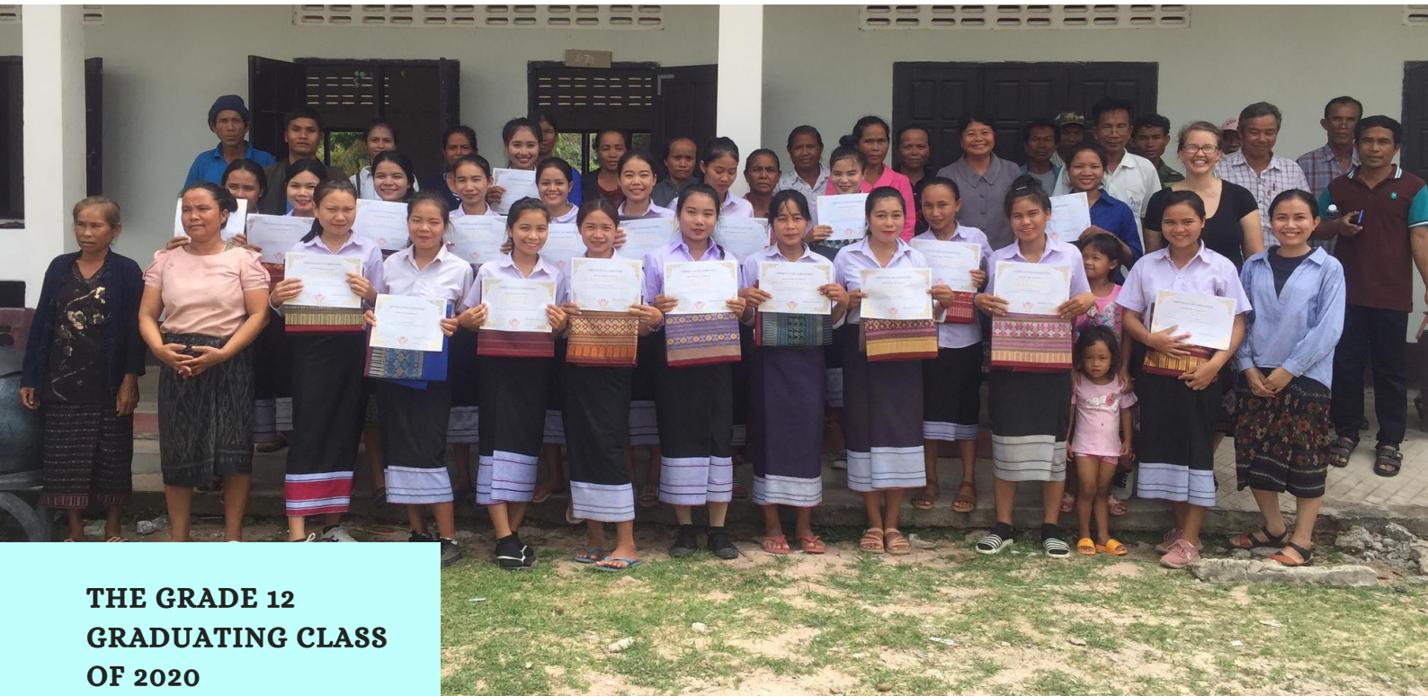
THE GRADE 12 GRADUATING CLASS OF 2020