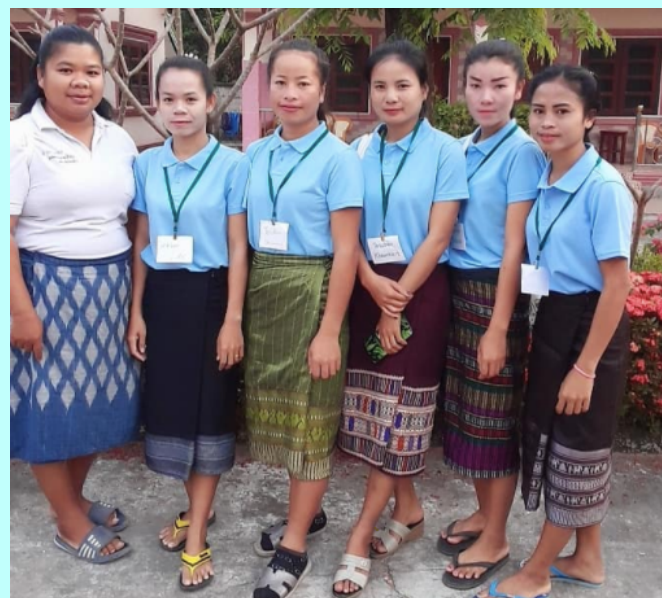
Some of the eager participants

The teachers were excited to return to school with resource packs supplied by Rotary.