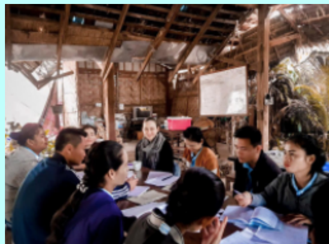
Teacher engaged in workshop activities