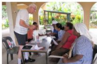
Giving Service in the Solomon Islands