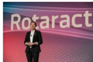
Starting a new Rotaract Club