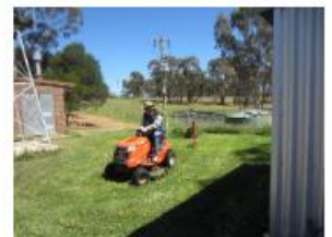
Working Bee at Camp Getaway