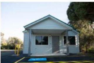
The Men's Shed

The Rotary Club of North Balwyn thank you for your support of this wine fundraising drive!