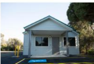
The Men's Shed

The Rotary Club of North Balwyn thank you for your support of this wine fundraising drive!