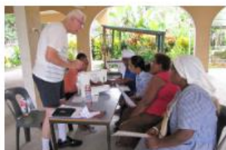
Giving Service in the Solomon Islands