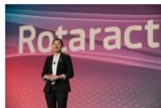
Starting a new Rotaract Club