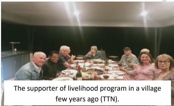
The supporter of livelihood program in a village few years ago (TTN).