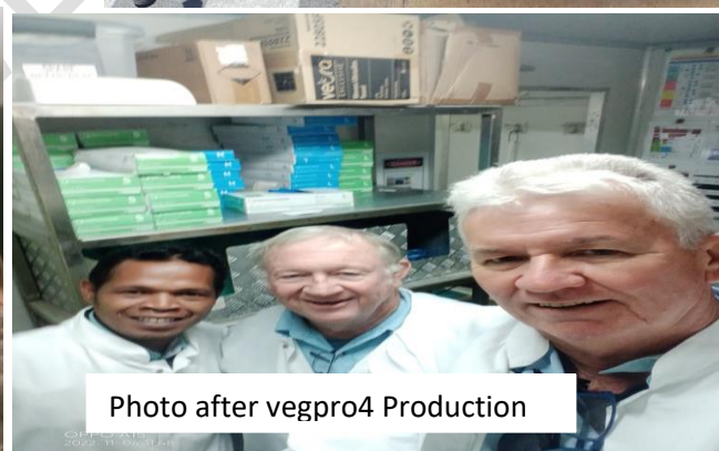
Photo after vegpro4 Production