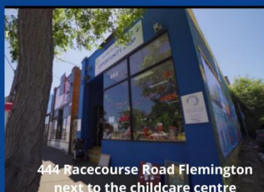
444 Racecourse Road Flemington next to the childcare centre