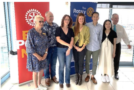
Paul Harris Society lunch.