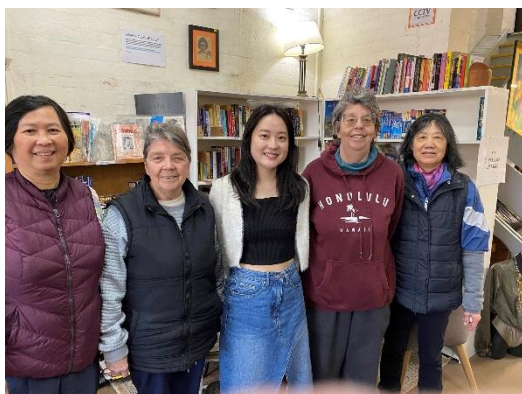
Rotary Club of Flemington Kensington Inc.