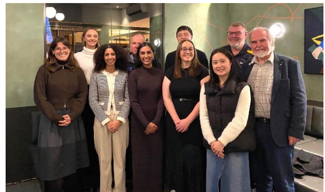
RC Albert Park Global Scholars