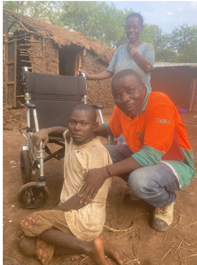
Mugishu cannot walk.