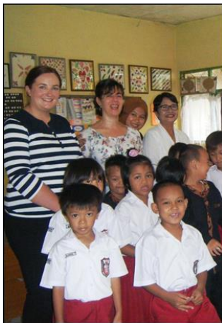
Sponsorship of the School for Autism in Indonesia completed the final stage with a donation of $7000 to complete the classroom works.

This project is featured on Rotary Showcase at