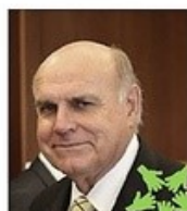
Bob Glindemann, OAM

Lord Mayor of the City of Melbourne. A champion of multiple sustainability initiatives to ensure Melbourne remains one of Australia's most sustainable cities.