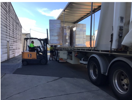
Andy loading pallets of For-a-Meal with the forklift.

DIK has again been the focal point for more aid to Ukraine. These photos show the last loading of 17 pallets of warm clothing, shoes, medical supplies and "For a Meal" packs ready for transport to Amberley Air Force base in Queensland before being flown to Europe. The pallets have been assembled at the DIK store over the past month.