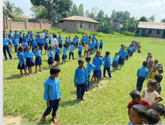
Janata Basic School, Lahan Municipality