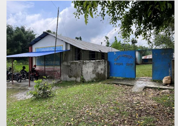
Churiyamai, Mohanpur, Udayapur