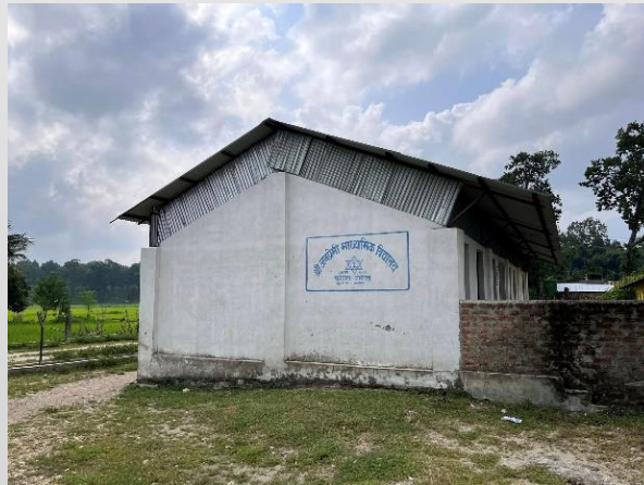
Janapremi secondary School, Udayapur