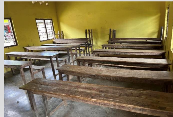
Furnitures situation of Shree Babaji Rajaji Secondary School, Lahan 13