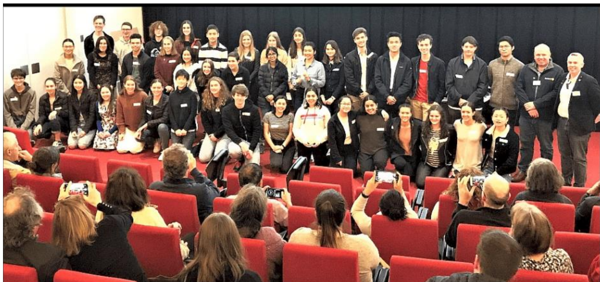
The 2020 NYSF District 9800 Team