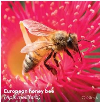
European honey bee ( Apis mellifera )