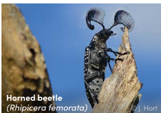
Horned beetle ( Rhipicera femorata )

Hoverflies are a type of fly, distinguishable by their large eyes, short antennae, bright black and yellow abdomen and their hovering flight behaviour. Adult hoverflies are nectar and pollen feeders. Hoverfly larvae feed on pests such as aphids, thrips and leafhoppers and are useful biocontrol agents.