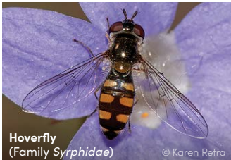
Hoverfly (Family Syrphidae)

Fly species number up to 30,000 in Australia, and can be identified by having only one pair of flight wings. A second set of wings are modified into club-shaped paddles that allow flies to hover and stabilise their flight. Unlike bees and wasps, they have very small, clubbed antennae at the front of their head. Flies, including blowflies, are often attracted to flowers that smell like carrion; they generally have hairy bodies that easily collect pollen while they are feeding. Flies provide a range of services in the garden, including pollination, decomposition and predation.