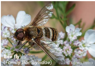
Bee fly (Family Bombyliidae)

Although many Australian native bees are generalist foragers, some species have co-evolved with native plants and adapted to be the most effective pollinators of their flowers. Many native plant species, such as Dianella and Grevillea require specially adapted insects to access their nectar and enable the transfer of pollen to the stigma. Most native bees are solitary, but some species found in northern Australia ( Tetragonula sp. and Austroplebia sp.) are social bees and are used for commercial pollination of crops like macadamia nuts.