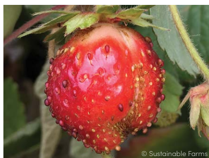
Under-pollination results in smaller, misshapen fruit such as this strawberry.

Insect populations are in decline worldwide due to land clearing, intensive or monocultural agriculture, pesticide use, pollution, colony disease, increased urbanisation and climate change. Low pollinator numbers mean not all flowers are pollinated, leading to low fruit or seed set. This in turn reduces fruit and vegetable harvest yields, and decreases food supply.