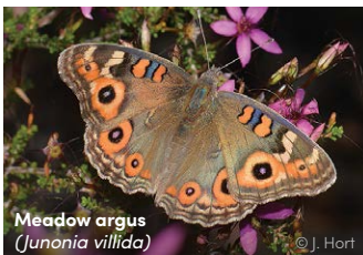
Meadow argus ( Junonia villida )

Beetles have hard outer wings that form their distinctive beetle shape. Their outer wings form a T-shape where they join at the top, unlike bugs where the outer wings make an X- or Y-shape. Beetles feed on nectar and pollen, usually by crawling over flower surfaces. There are around 30,000 species of beetles in Australia, with many yet to be formally described.