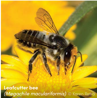
Leafcutter bee ( Megachile maculariformis )

Honey bees have become an important part of the Australian landscape. Honey bees live as colonies, and have a long history of coexistence with humans, including in domestic gardens.