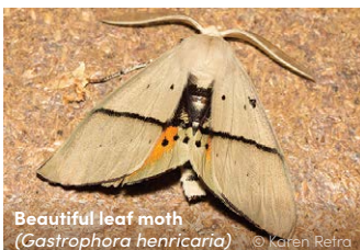
Beautiful leaf moth ( Gastrophora henricaria )

Butterflies have wings covered in tiny scales. They have clubbed antennae and hold their wings upright when at rest. They are day-flying and have long tongues that they can use to feed on nectar in flowers with deep tubes. Butterflies are usually brightly coloured, with approximately 600 species found in Australia.