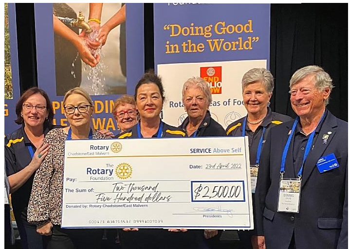
Chadstone-East Malvern and their "big cheque"