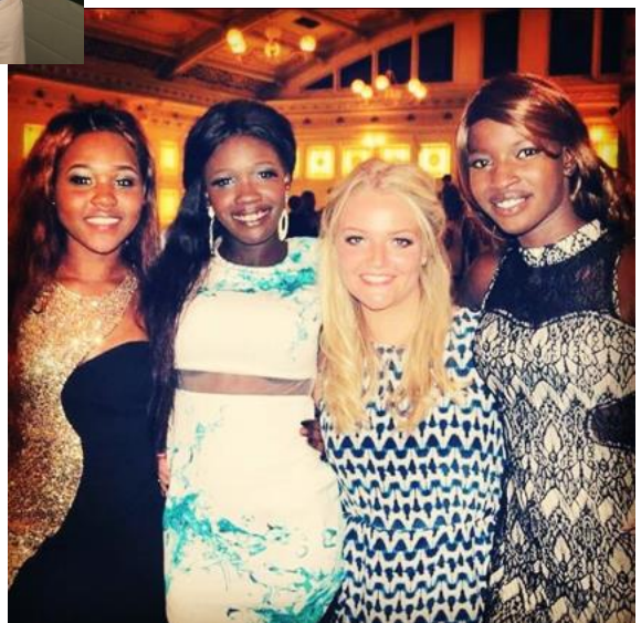
Semi formal with some school friends from School