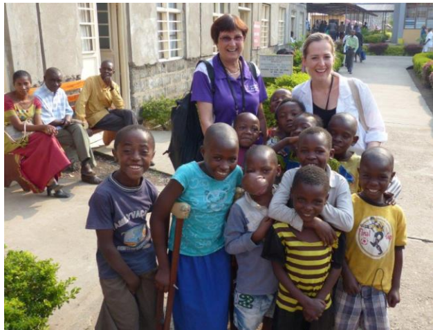
At the Congo Hospital