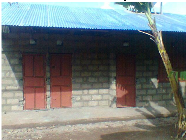
The (nearly finished) kitchen at the Mamba School