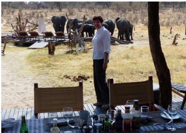
The elephants emptying the 'swimming pool'