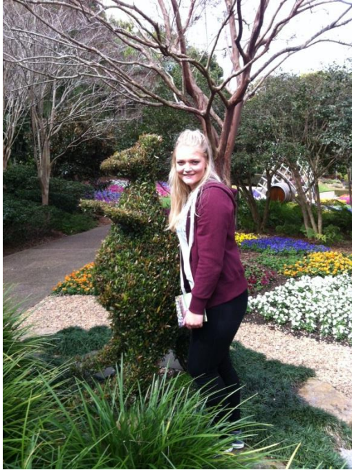
Taking in Roma Street Parklands